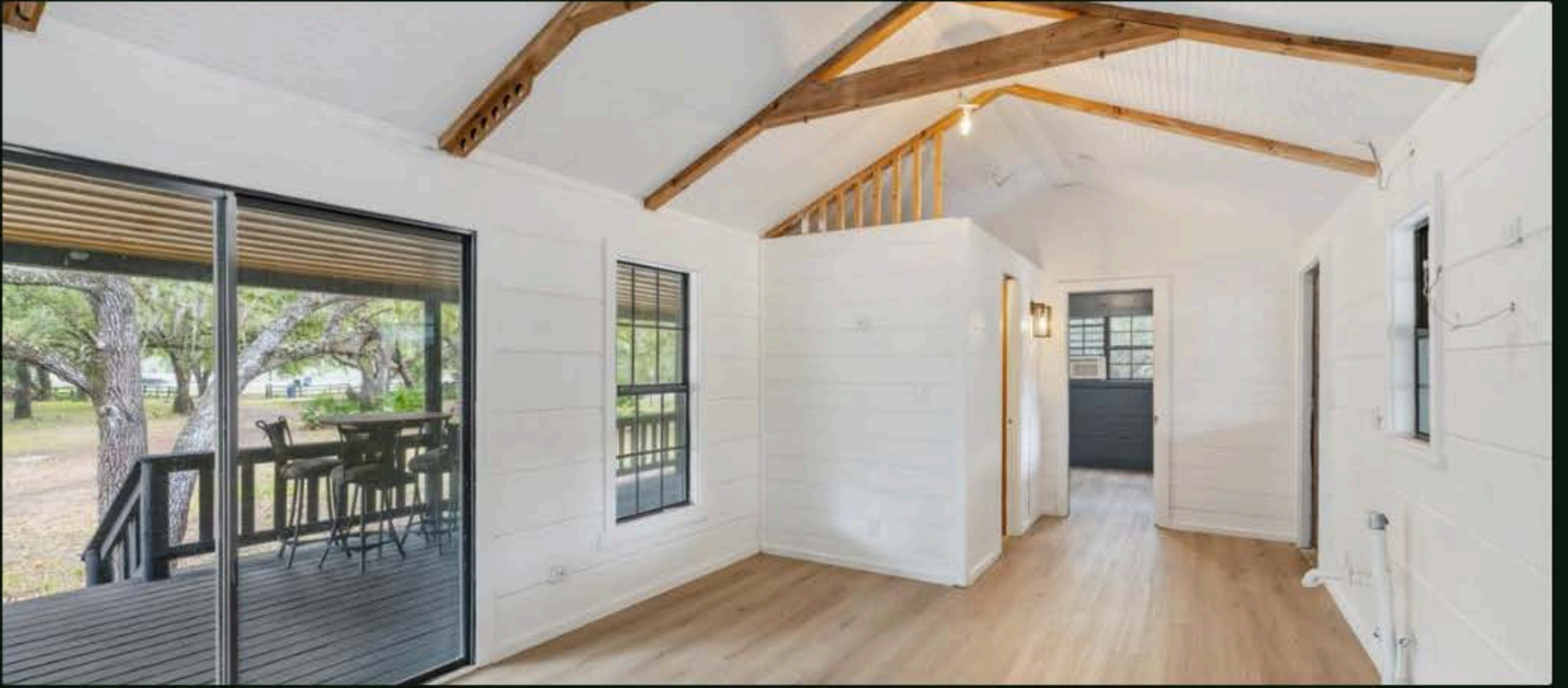
VAULTED INTERIOR — EXPOSED TIMBER TRUSSES, SHIPLAP WALLS, LUXURY VINYL PLANK FLOORS