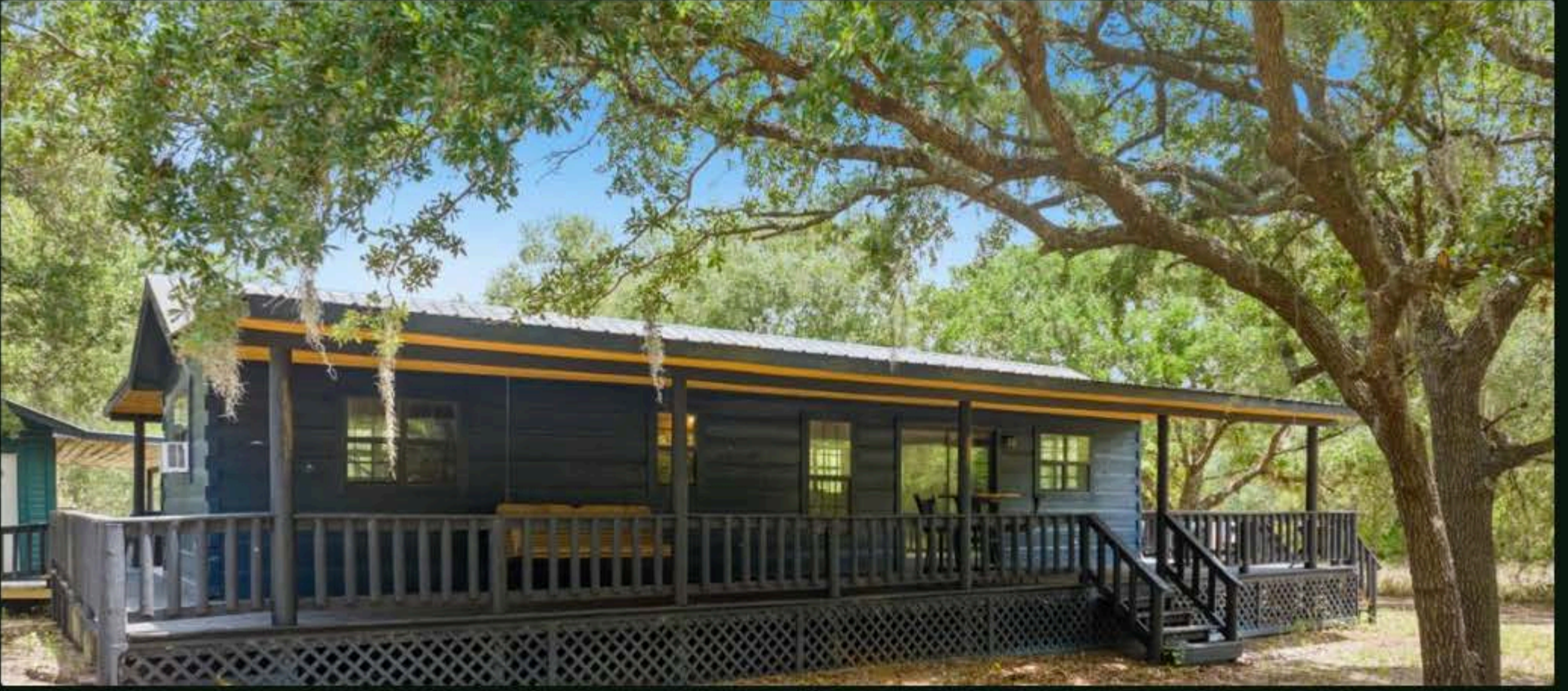
MAIN CABIN – WRAPAROUND DECK UNDER THE OAK CANOPY