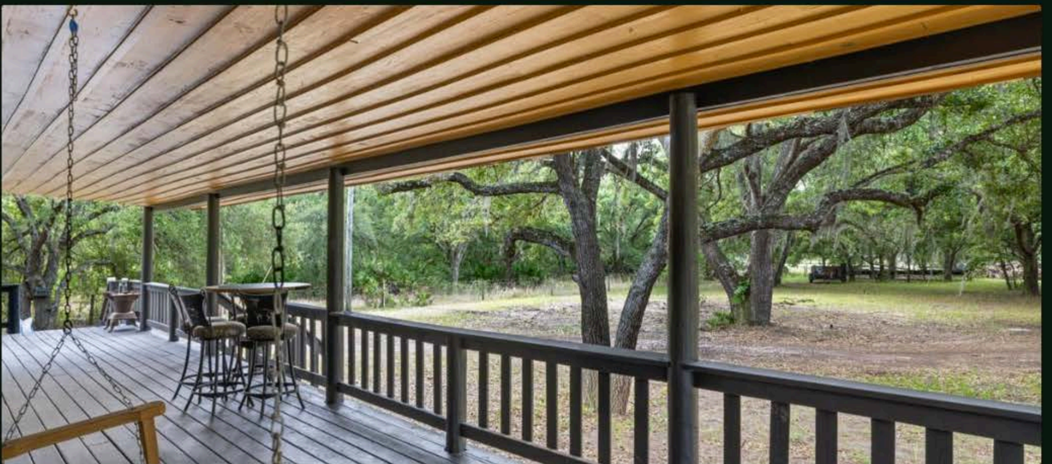
COVERED WRAPAROUND PORCH — PORCH SWING, BAR SEATING, VIEWS OF THE OAK GROVE