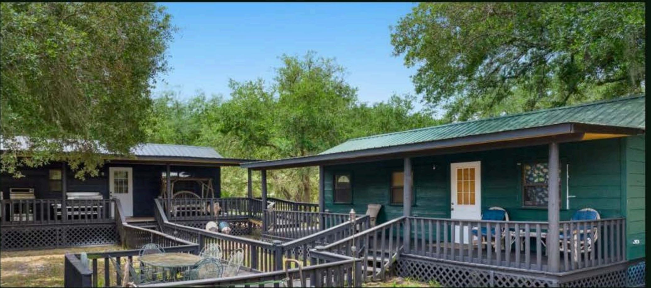
BOTH CABINS – CONNECTED BY PRIVATE BOARDWALK & SHARED DECK