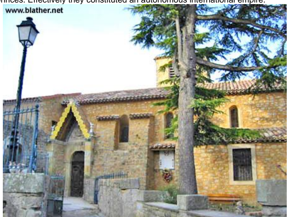
The church at Rennes-le-Château

The Knights Templar are the so-called Warrior Monks who were proclaimed by Pope Innocent II in a Papal Bull in 1139 to owe allegiance only to the Pope, and were therefore under no obligation to kings and princes. Effectively they constituted an autonomous international empire.