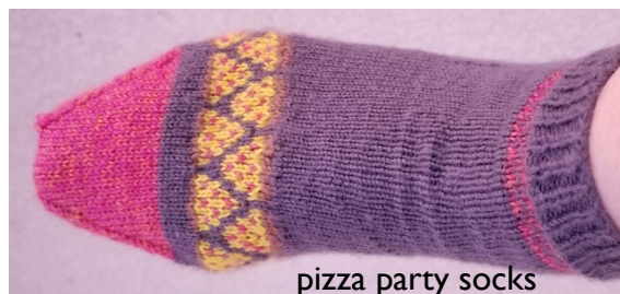
pizza party socks