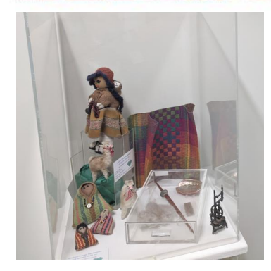
Exhibit at Winchester Dondero Cultural Center 3130 McLeod Drive, Las Vegas, NV 89121 Exhibit open from February 14—March 25, 2022

Fiber Arts Presentation (demo) Thursday March 10, 2022, 11 am-2pm