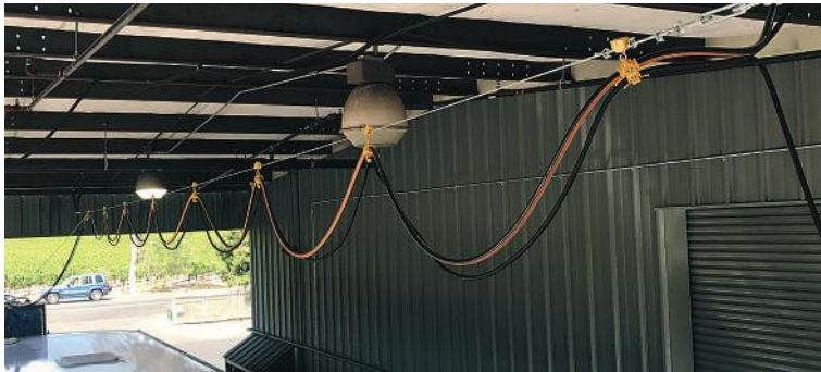
Overhead Festoon System

* 10'10"-12'6"-13'6" wash heights in stock. Custom wash heights available.