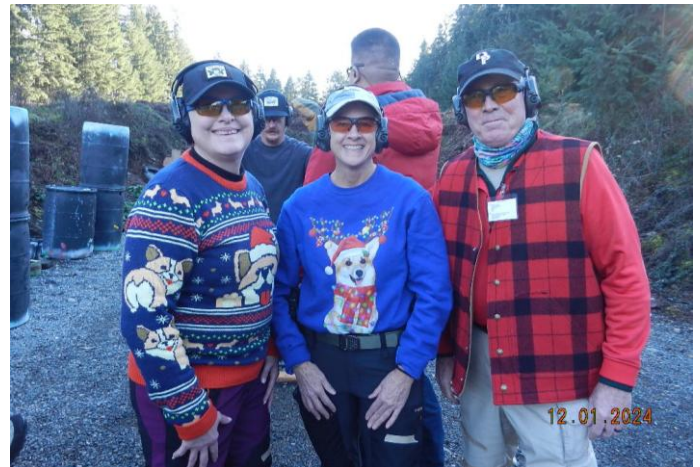
Some happy ASI shooters

As we approach 2026, let me introduce a few updates. In the past we have allowed walk-ons, due to us moving away from paper waivers for both the range and ASI, we are requiring all competitors to register on www.practiscore.com and at www.asi-usa.org . Please take the time to register to both. This helps us in the Stat Shack with squad management and planning for New Shooter Orientation attendance. Once you registered on PracticeScore, you will find us under MATCHES tab searching for ASI at Paul Bunyan .