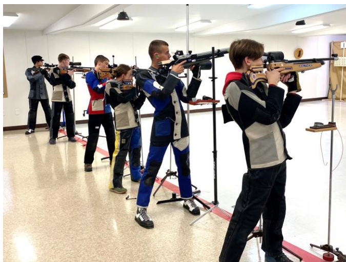
Standing competition at the All-Army airgun match

Our first airgun match of the season, the annual All-Army Air Rifle Match, was held on October 29th. This was a virtual match, with competitors shooting at venues across the country. Match results can be found on the Orion website here .