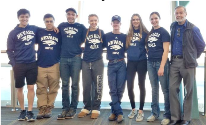
The winning UNR team