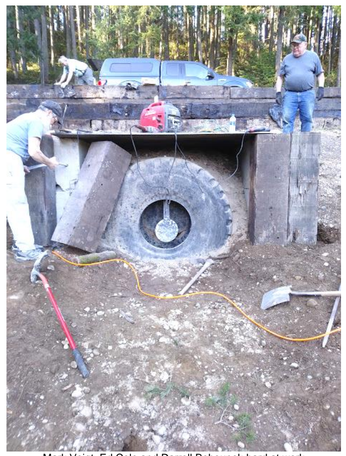
Mark Voigt, Ed Cole and Darrell Behounek hard at work

gong tire and bulkhead timber The replacement project that had the rifle range shut down for a few days in late January and early February is finally complete. What started out as a good- sized job requiring a contractor with heavy equipment turned out to be even bigger as the job progressed. Once the new (used) tires and backing material were in place, it was decided that we needed ecology blocks with timber fronts to frame the tires, along with steel "evebrows" to prevent rounds from skipping off the top of the tires. A lot of this work, with a bunch of sweat, blood and a few bad words, was completed by club volunteers. Thanks go out to Mark Voigt, Mark Kosin, Darrell Behounek. Doug Nash, Doug Shellenberger, Dave Farrow and Don Hehn for all of their help with the project.