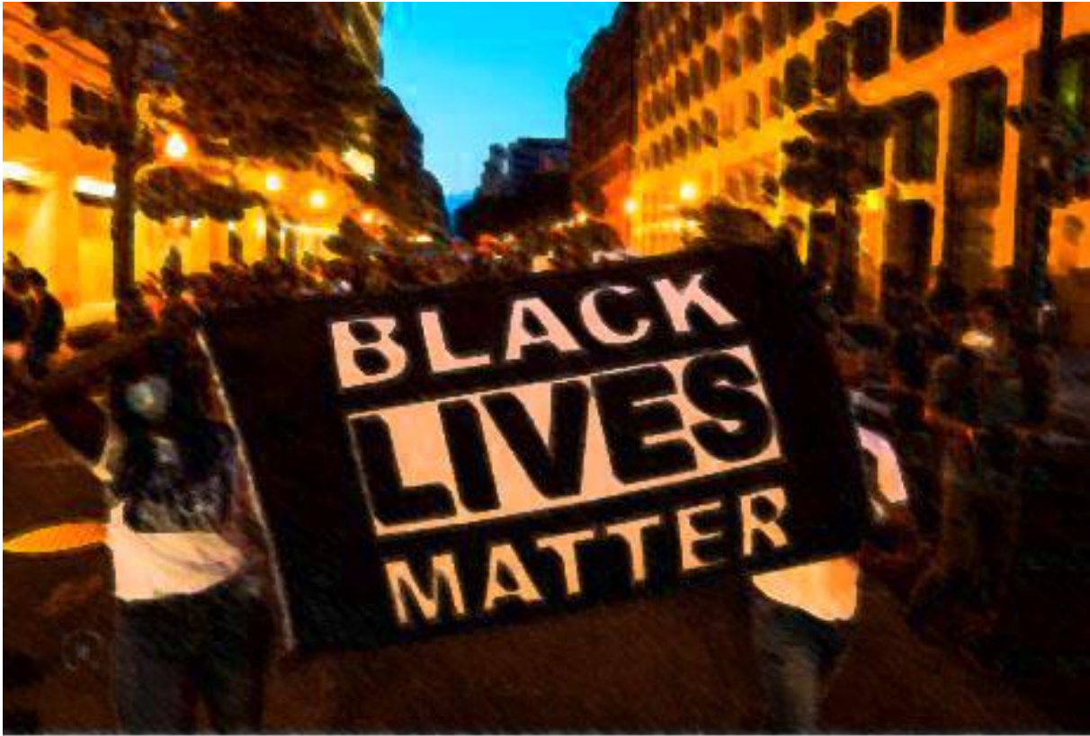
(Photo : REUTERS/Erin Scott (Altered from original image). This file is licensed under the Creative Commons Attribution 4.0 Unported license.