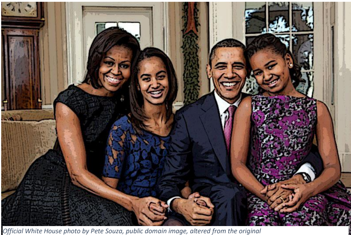
Official White House photo by Pete Souza, public domain image, altered from the original