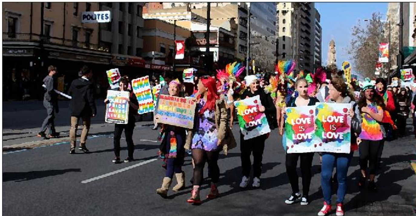
Image courtesy of "Marriage Equality Adelaide" (CC BY-NC 2.0) by Adelaide Archivist. The image is licensed under the Creative Commons Attribution-Noncommercial 2.0 Generic (CC BY-NC 2.0) license. Altered from the original.