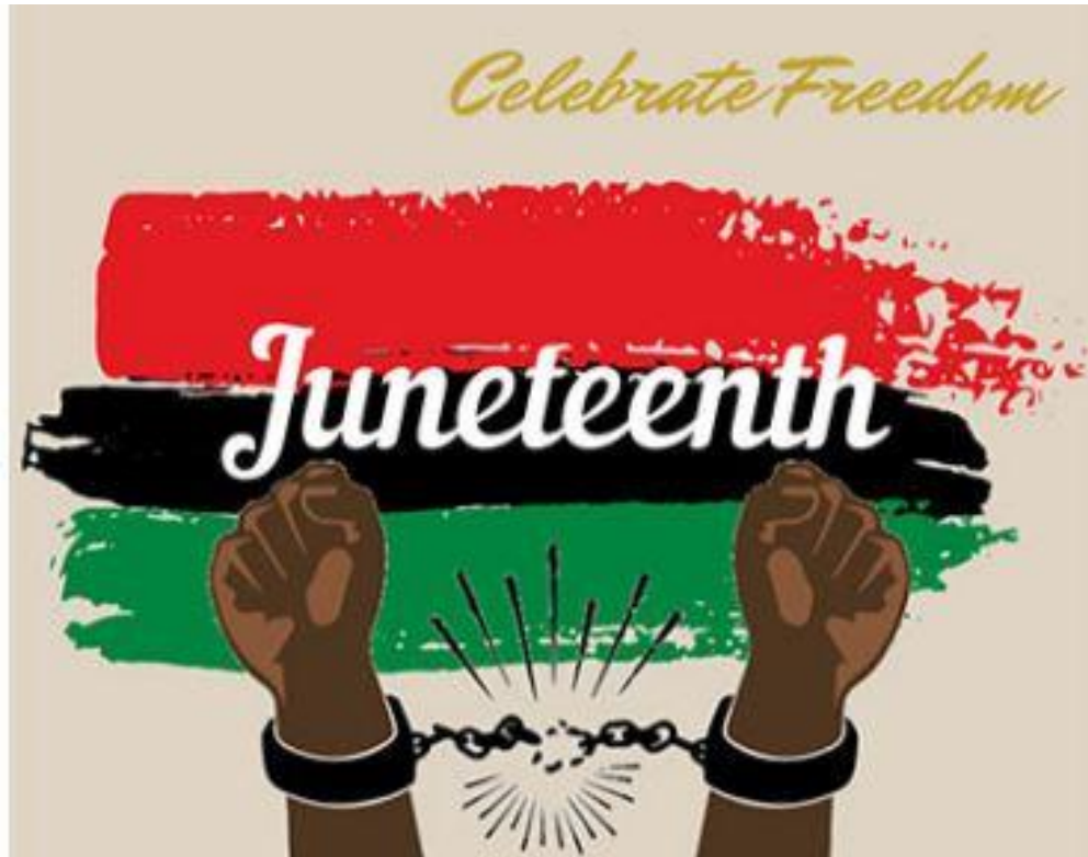
Image altered from original.