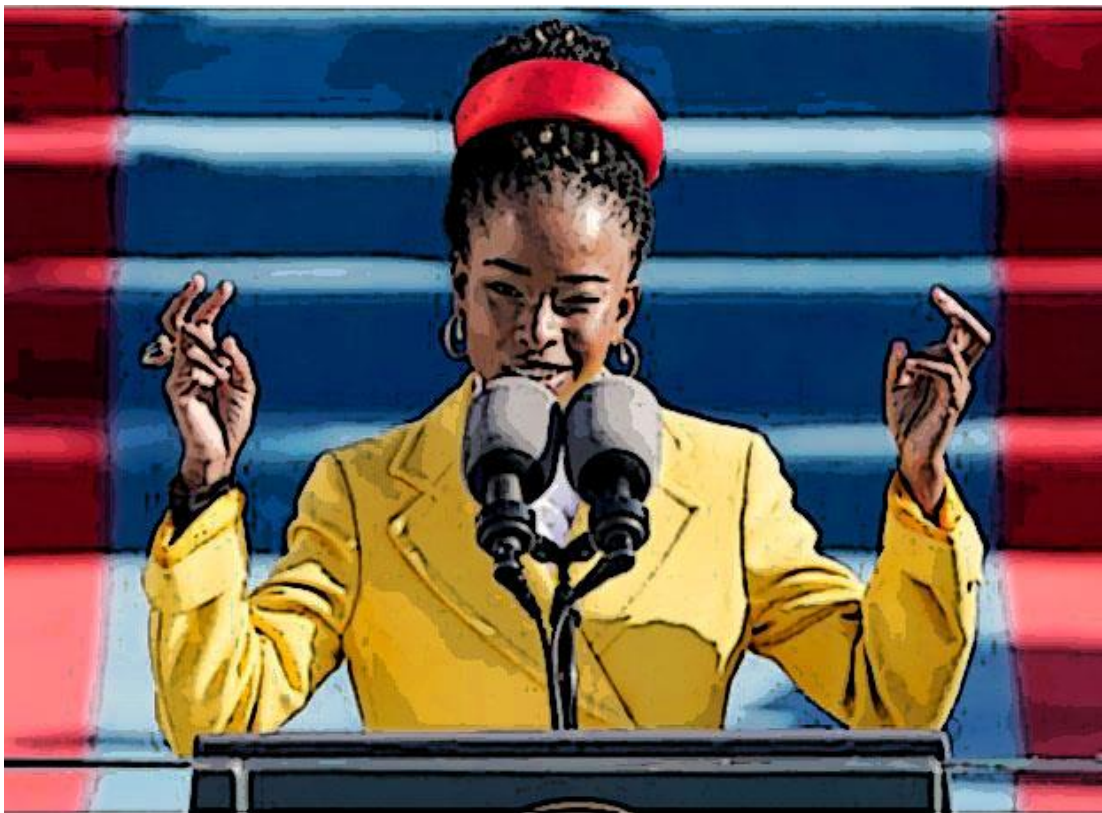
Image courtesy of Chairman of the Joint Chiefs of Staff from Washington D.C, United States, public domain footage licensed under Creative Commons Attribution 2.0. Image altered from the original.