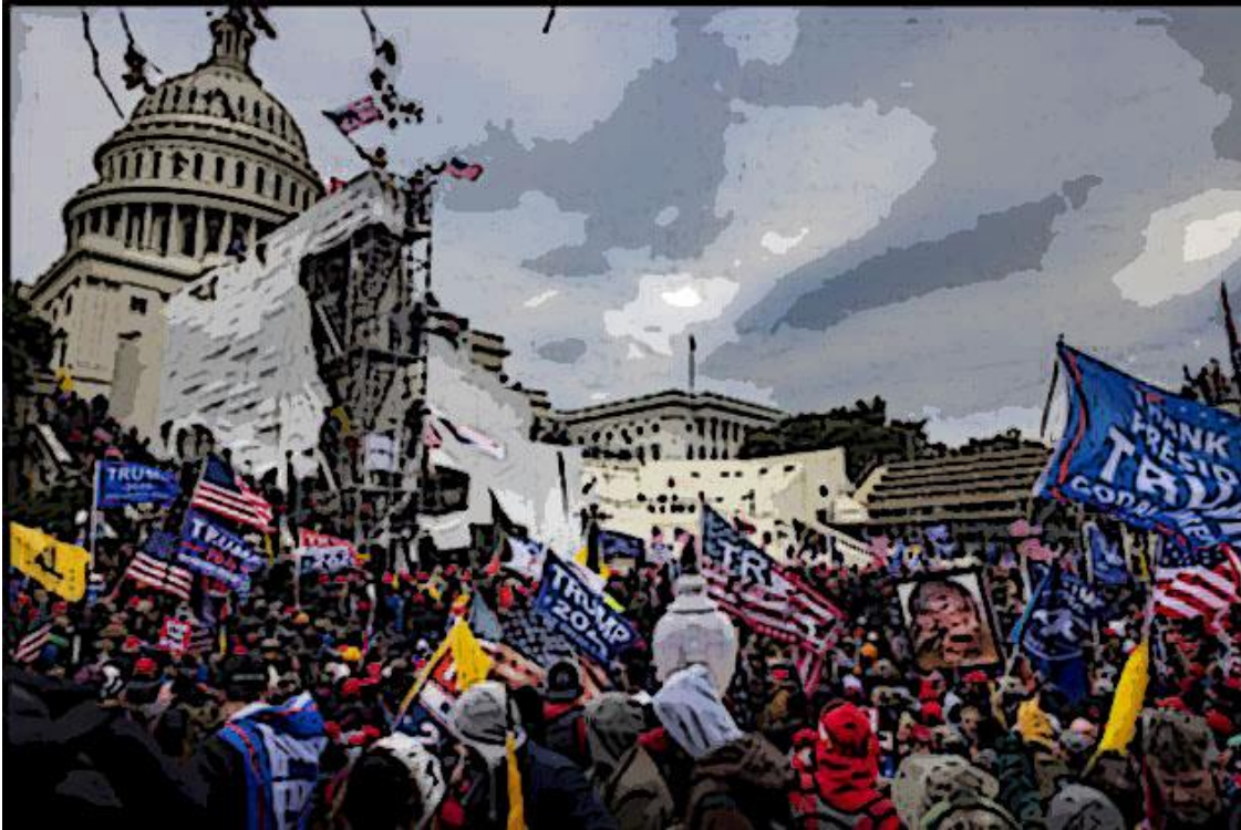
Image courtesy of TapTheForwardAssist via Wikimedia Commons, licensed under Creative Commons Attribution-Share Alike 4.0. Image altered from original.