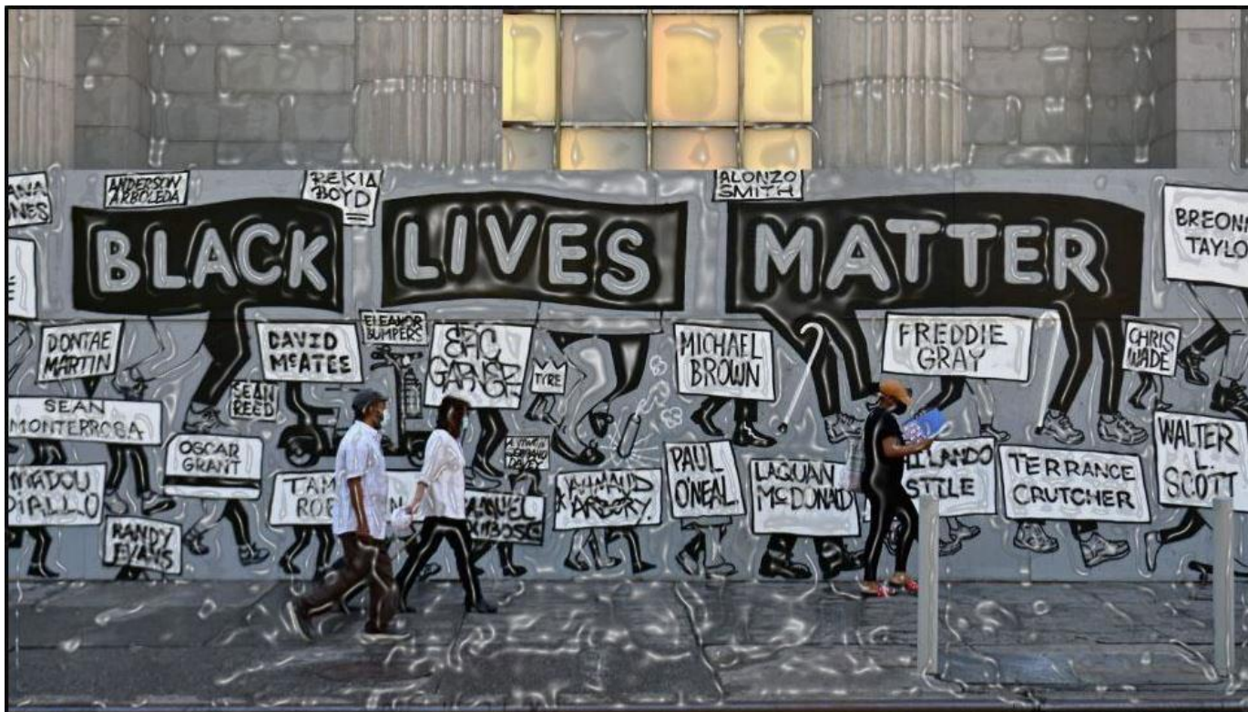
Image of NYC BLM mural Image altered from the original.