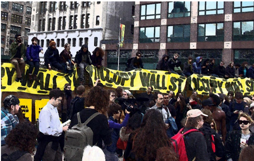
Day 60 Occupy Wall Street November 15 2011 Shankbone 18.JPG. This file is licensed under the Creative Commons Attribution 3.0 Unported license. Altered from the original image.