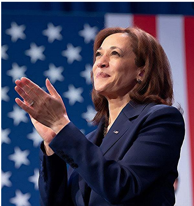
Image altered from original.