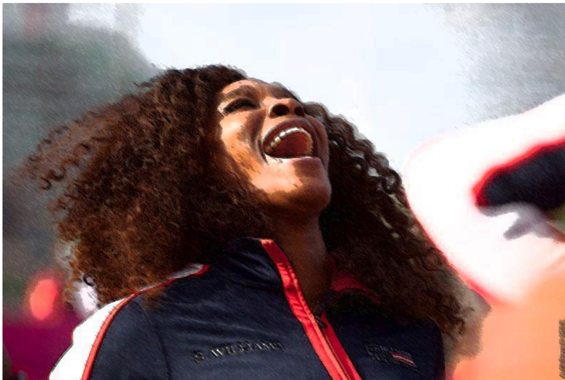
This image courtesy of Александр Осинов from Ukraine, via Wikipedia Commons . This file is licensed under the Creative Commons Attribution-Share Alike 2.0 Generic license . Altered from the original image.