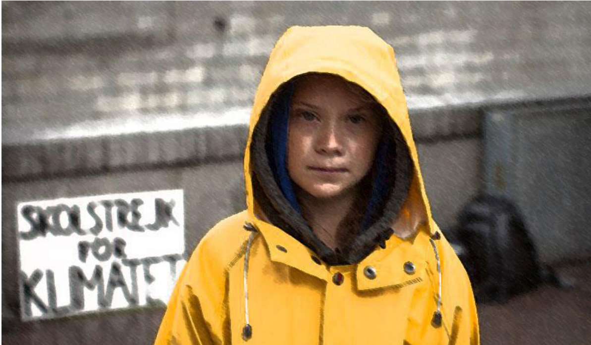
Photo courtesy of Anders Hellberg via Wikimedia Commons, licensed through Creative Commons Attribution-Share Alike 4.0. Image altered from original.