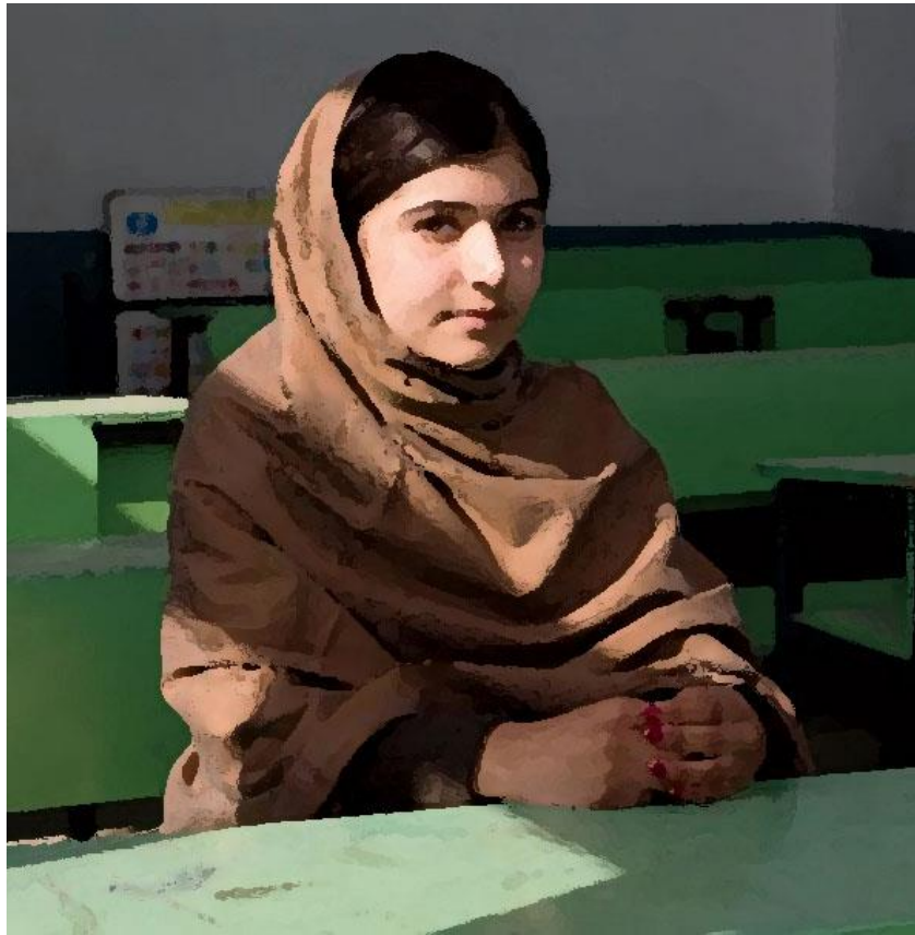
Image courtesy of https://yellowbunting.wordpress.com/2013/06/14/malala-yousafzai/ , This file is licensed under the Creative Commons Attribution 3.0 Unported license. Altered from the original image.