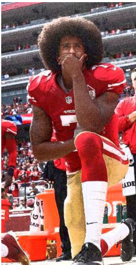
The image is licensed under the Creative Commons Attribution-Noncommercial 2.0 Generic (CC BY-NC 2.0) license. Altered from the original.