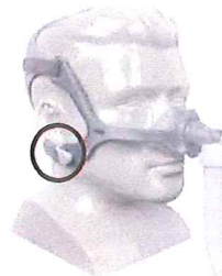
Figure 4: Wisp and Wisp Youth Nasal Mask