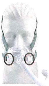
Figure 1: Amara View Full Face Mask

Figures 1 – 5 shows the images of the affected masks and Figure 6 (next page) contains their part numbers. The magnetic headgear clips on these masks are circled. Use the below images (Figures 1-5) and the Part Numbers (see Figure 6) in this letter, to determine if your or your patient's mask also uses magnetic headgear clips. These masks are intended to provide an interface for application of CPAP or bi-level therapy to patients.