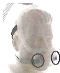
Figure 3: DreamWear Full Face Mask