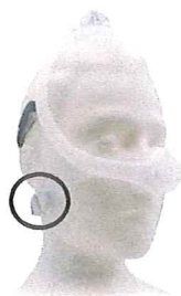
Figure 2: DreamWisp Nasal Mask