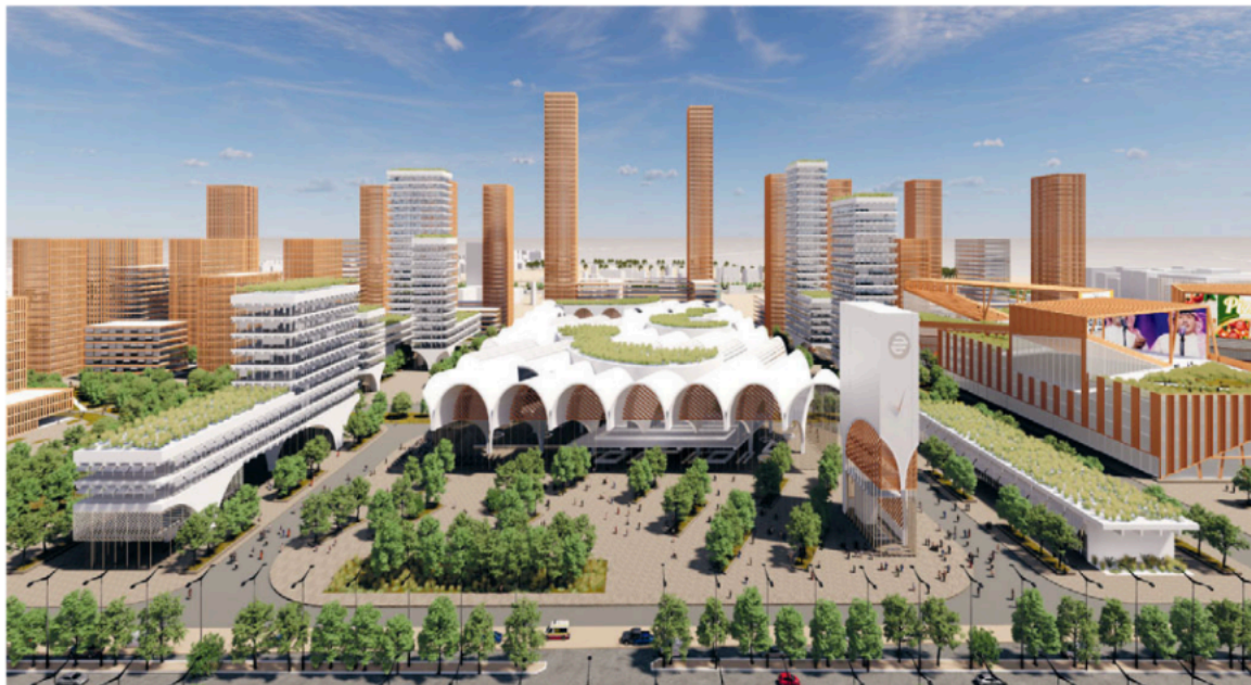
Since its establishment, JMC and Partners has earned a reputation for delivering complex projects in the region