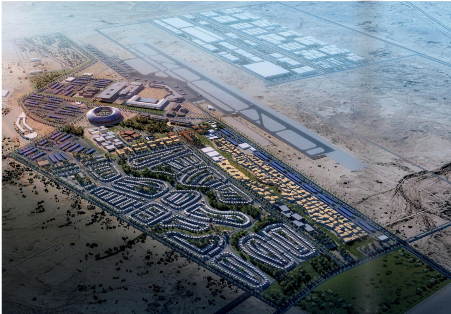
Aerial rendered image of the Sela Falcon City in Malham, Riyadh