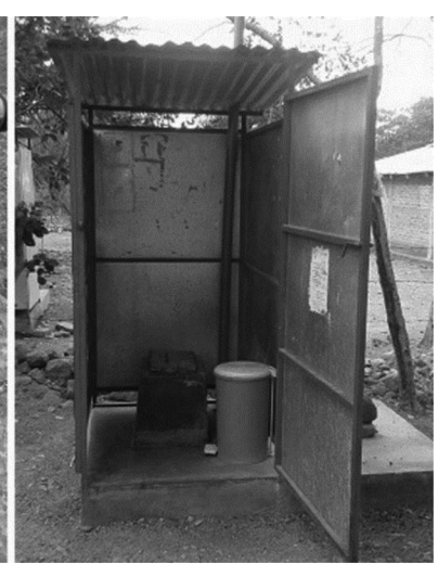
Figure 1. The three primary WatSan technologies in Darío. Rope and electric pumped wells (left and middle, respectively) and ventilated improved pit latrine (right).

the weighted network the communication link was intended to represent a level of efficacy for resolution. As such, in addition to asking interviewees who they spoke with in the event of a problem, they were also prompted to categorically score the time it took to typically resolve the problem, the frequency in which the WatSan technology typically breaks down, and to present their opinion on the utility or efficacy of the communication with said stakeholder. For time, a higher edge score was given for a shorter duration of time to resolve the issue, where the scores were (4) - days, (3) - weeks, (2) - months, and (1) - years/never. For frequency of break downs, a higher score was given for a lower frequency, where the scores were (5) - hardly ever, (4) - yearly, (3) - monthly, (2) - weekly, (1) daily. For the stakeholder's opinion on efficacy, a higher score was given for a more favourable level of efficacy from (4) - very good, (3) - good, (2) - mediocre, and (1) - not good at all. In this way, it was possible to construct weighted networks representing aspects of WatSan resolution efficacy.