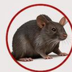
RODENTS (MICE & RATS)