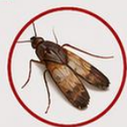
PANTRY PEST (MOTHS, WEEVILS, BEETLES)