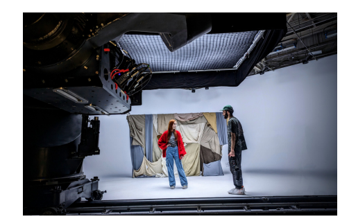
AVALON EXCHANGE CAMPAIGN