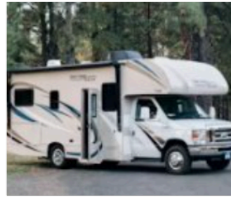
Caravans and RV's