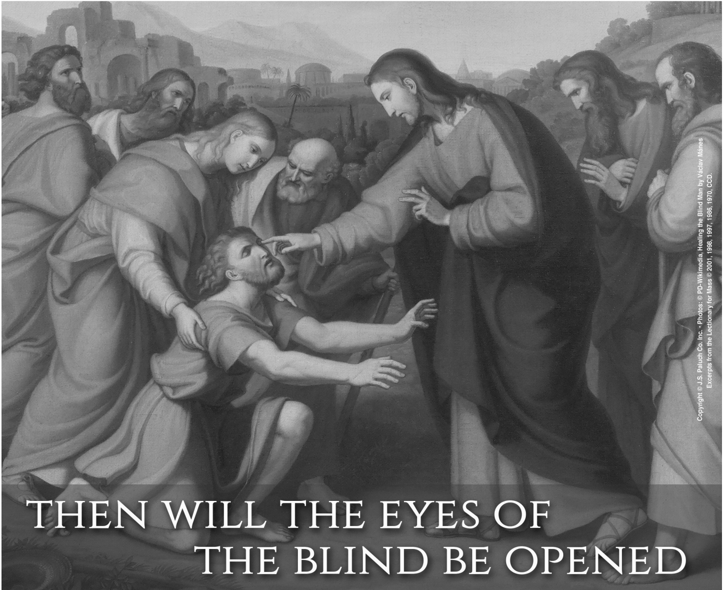
Copyright © J.S. Faluch Co. Inc. - Photos: © PD-Wikimedia, Healing the Blind Man by Václav Mánes Excerpts from the Lectionary for Mass © 2001, 1998, 1997, 1986, 1970, CCD.

THEN WILL THE EYES OF THE BLIND BE OPENED