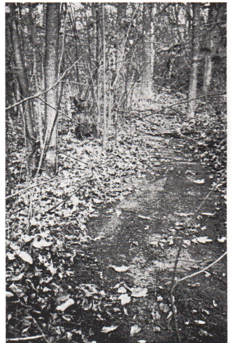
One of the old sidewalks found at Morton Taylor and Ford Road.

This area is located just south of Ford Rd. and east of Morton Taylor. The property is currently being developed by Office Max. Much of the property will be designated as wetlands. If the sidewalks are in good enough shape perhaps it could make a great area for people to visit and see the " sidewalks in the woods ." If anyone has information about the sidewalks or the area, please call the Canton Historical Society at (734) 397-0088 and leave a message.