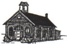
Canton Center School

The Society has a Cemetery Book available listing the people in the older cemeteries of Canton Township. If you are doing a genealogy study this book is a must. The book can be purchased at our Canton Historical Museum or at Master Lighting, 44125 Ford Road east of Sheldon.