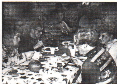
Enjoying the pot luck dinner with friends and neighbors.