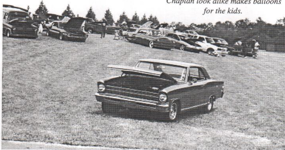
Custom cars could be seen all around the big pond in Heritage Park.