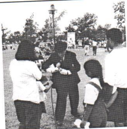
Chaplan look alike makes balloons for the kids.