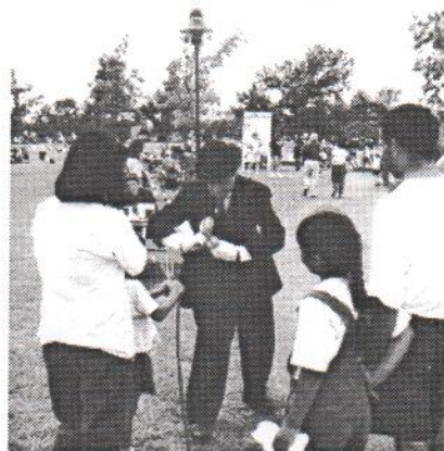
Chaplan look alike makes balloons for the kids.