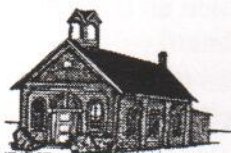
Canton Center School

The Society has a Cemetery Book listing the people buried in the older cemeteries of Canton Township. If you are doing genealogy this book is a must. It can be purchased at Canton Historical Museum. The museum is located at the corner of Canton Center Rd. and Heritage Drive, ( next to the new Fire Station No. 1 ). The hours are Tuesday 1 pm to 3 pm and Saturday from 1 pm until 4 pm.