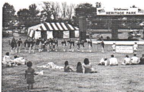
Plymouth Fife and Drum Corps played while the crowd watched from the hill.