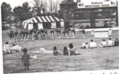
Plymouth Fife and Drum Corps played while the crowd watched from the hill.