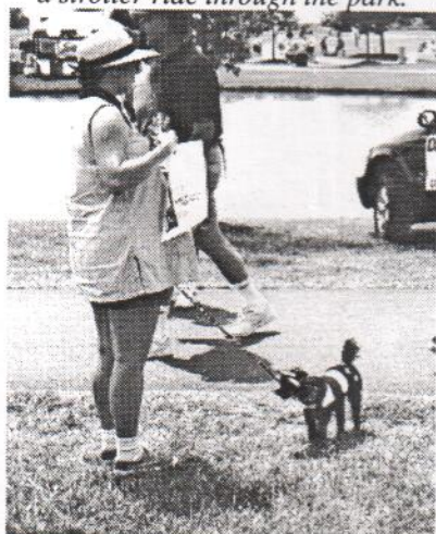
This patriotic pet was all dressed up for Liberty Fest 99.