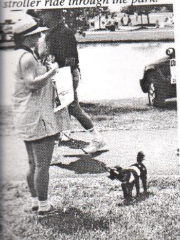
This patriotic pet was all dressed up for Liberty Fest 99.