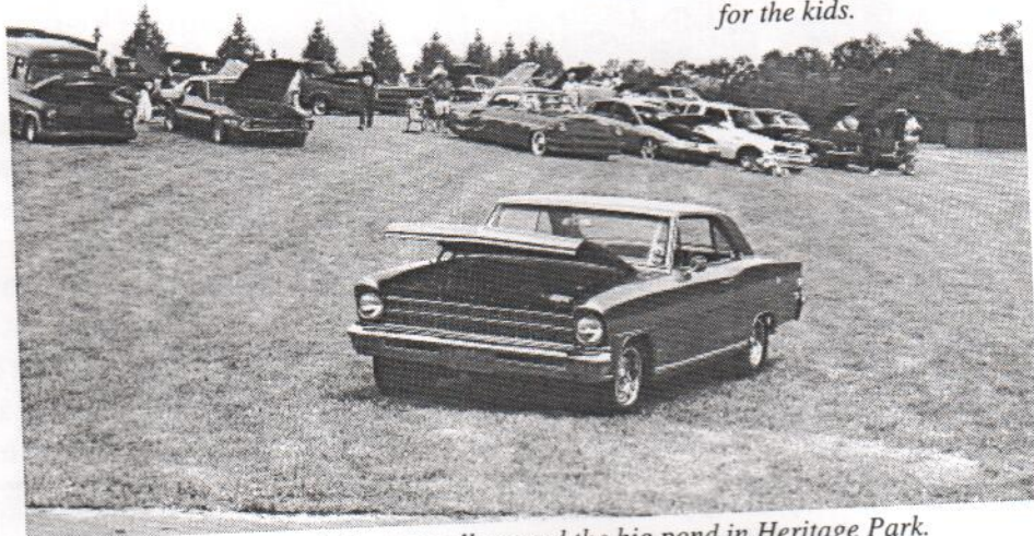
Custom cars could be seen all around the big pond in Heritage Park.