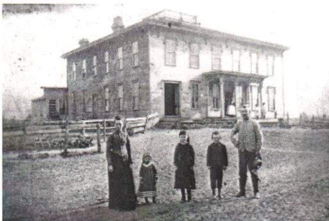
Photo of the Cherry Hill Inn and the Gunn family who owned the building at the time. (late 1880's)