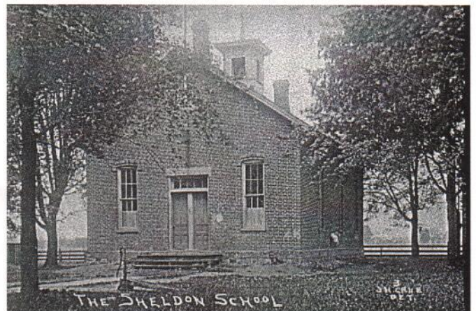
Sheldon School, now being repaired as well as our museum.