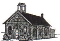
Canton Center School

The Society has a Cemetery Book listing the people buried in the older cemeteries of Canton Township. If you are doing genealogy, this book is a must. It can be purchased at Canton Historical Museum. The museum is located at the corner of Canton Center Rd. and Heritage Drive, ( next to the new Fire Station No. 1 ). The hours are Tuesday 1 pm to 3 pm and Saturday from 1 pm until 4 pm.