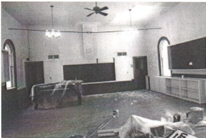
The repairs have started.