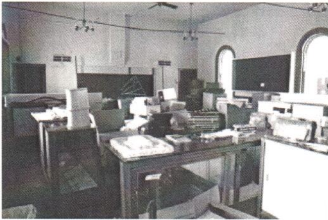
Packed up and ready for the move.