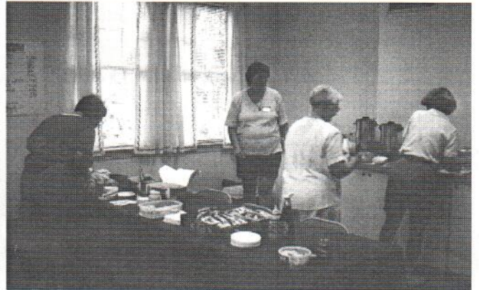
Good volunteer help for the kitchen.