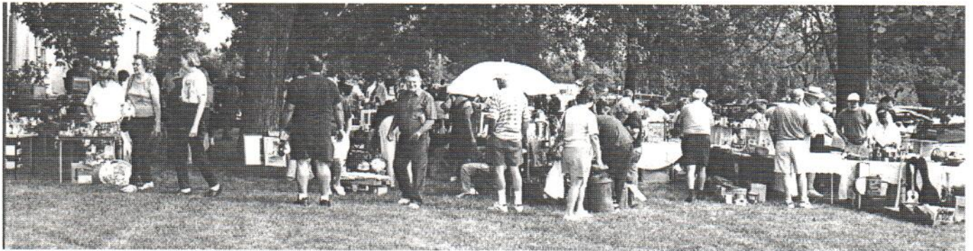
Lots of Shoppers for our annual Flea Market at Cherry Hill School.