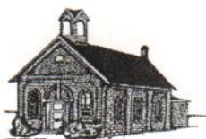
Canton Center School

The Society has a Cemetery Book listing the people buried in the older cemeteries of Canton Township. If you are doing genealogy this book is a must. It can be purchased at Canton Historical Museum. The museum is located at the corner of Canton Center Rd. and Heritage Drive, ( next to the new Fire Station No. 1 ). The hours are Tuesday 1 pm to 3 pm and Saturday from 1 pm until 4 pm.