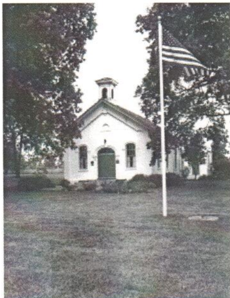
Cherry Hill School as it is today.

The Cherry Hill School has been used for many different activities since it no longer has students. It still serves as a valuable asset to