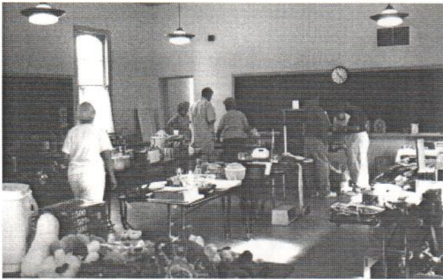
Many donated items for sale.