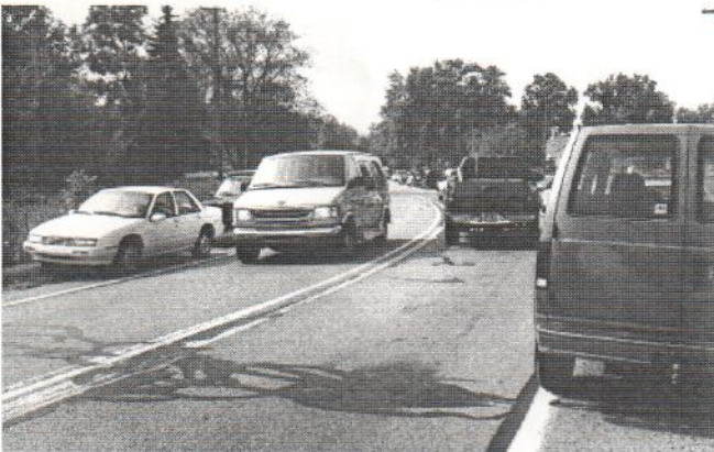
Cars and trucks lined the street.