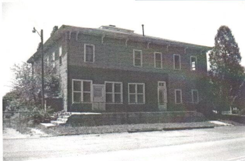
Cherry Hill Inn