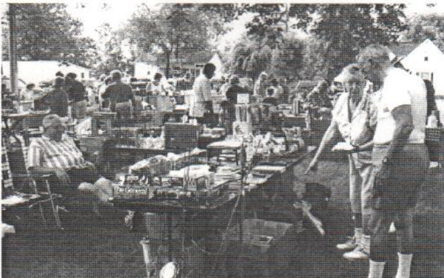
I think she wants this one.