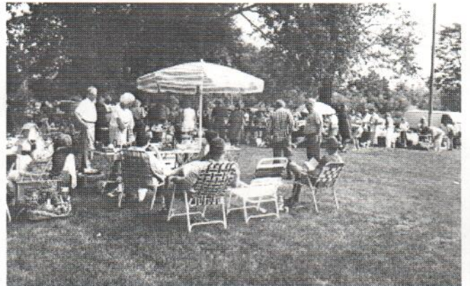
A cool umbrella makes for a relaxed setting.