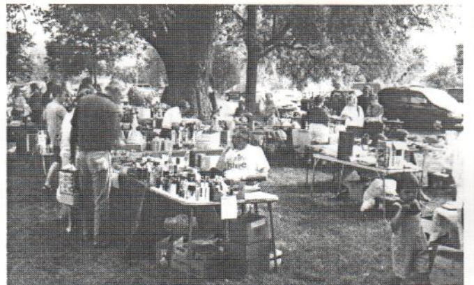
Looking for bargains is what it's all about.