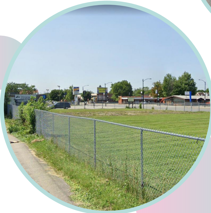
LOOKING SOUTH FROM THE ALLEY