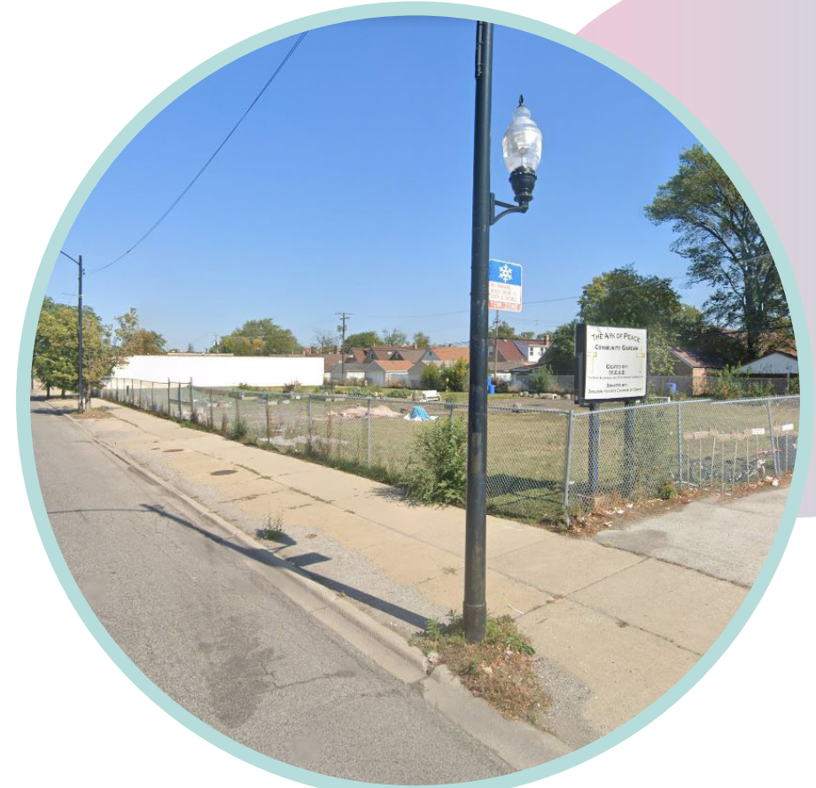
LOOKING NORTH FROM CORNER OF SITE