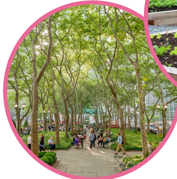
CANOPY / ORNAMENTAL TREES