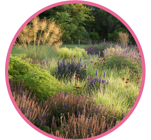
PLANT MATRIX / POLLINATOR GARDEN