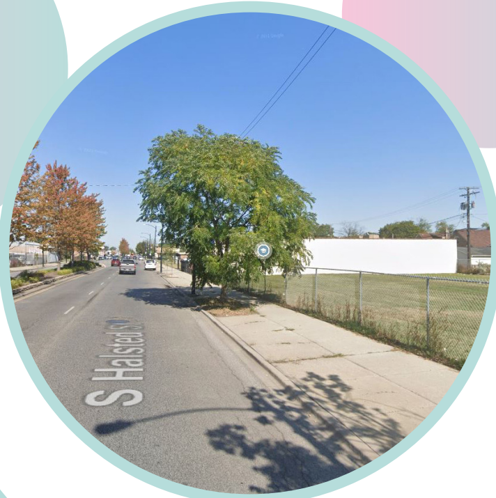
LOOKING NORTH ON HALSTED ST