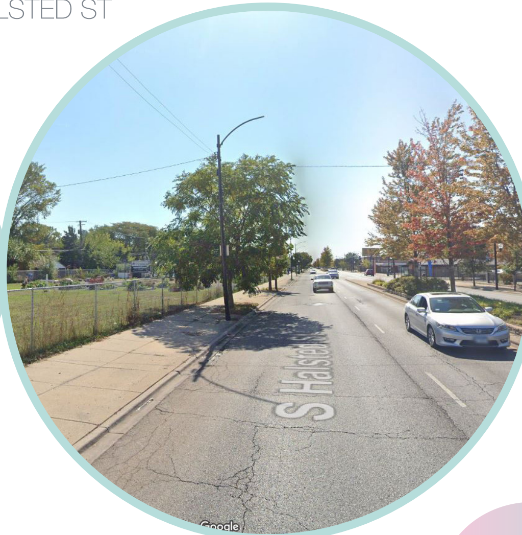
LOOKING SOUTH ON HALSTED ST