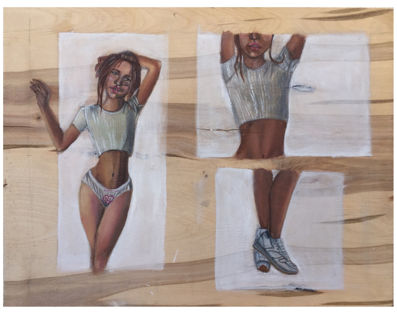
Entry 8 Reebok