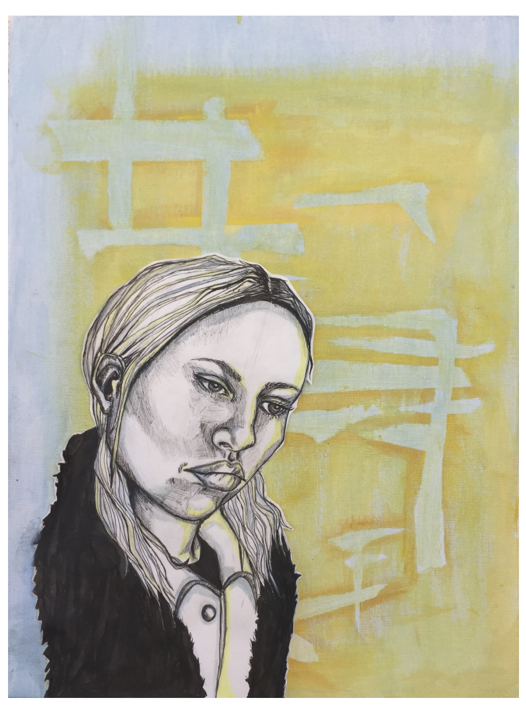
Entry #9 Sad Girl