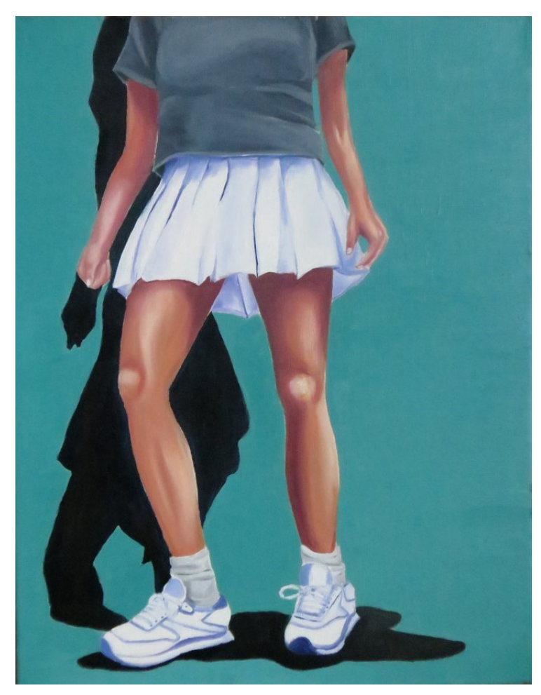
Entry #12 Tennis Court