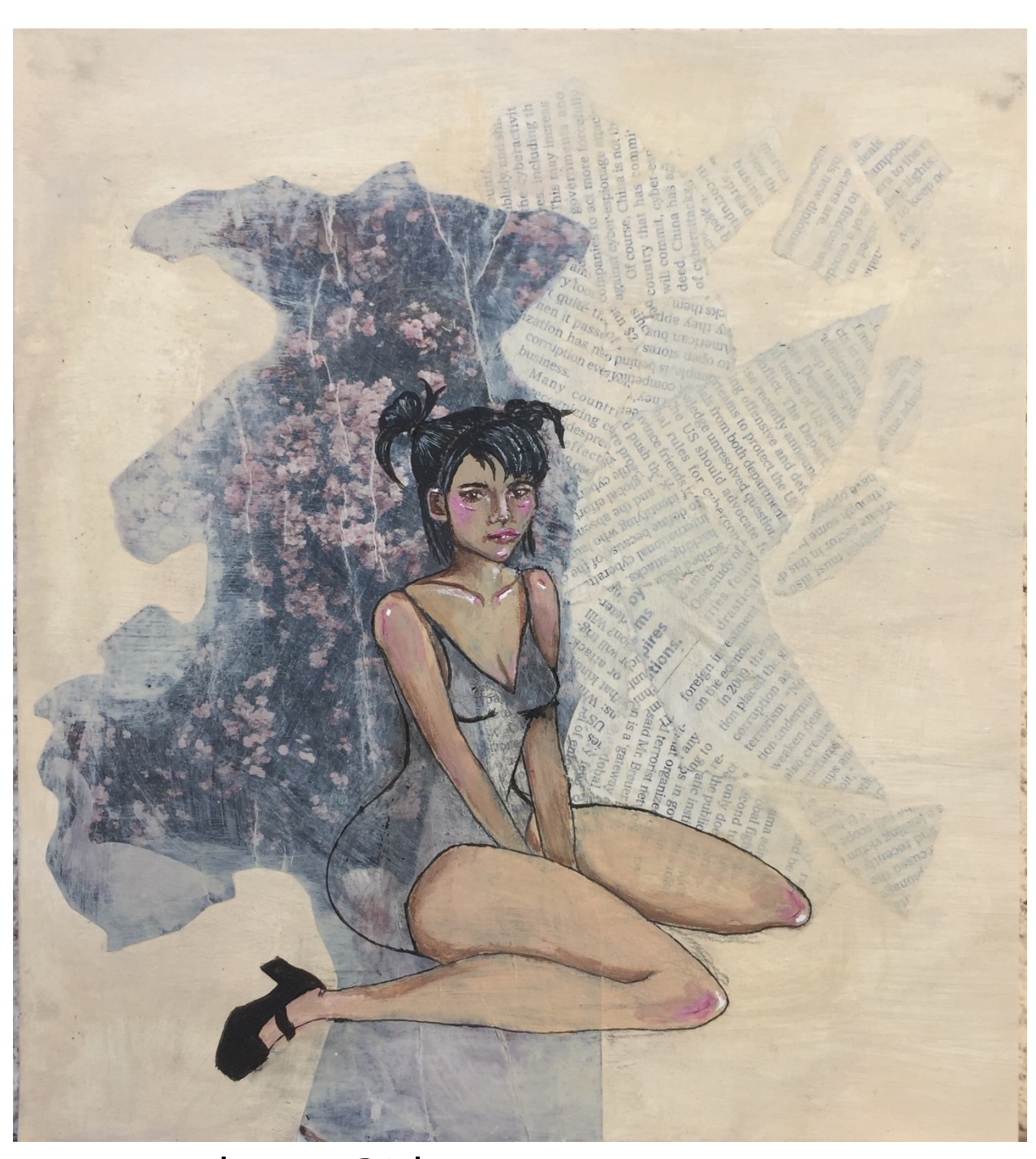
Entry#7 Flower Girl