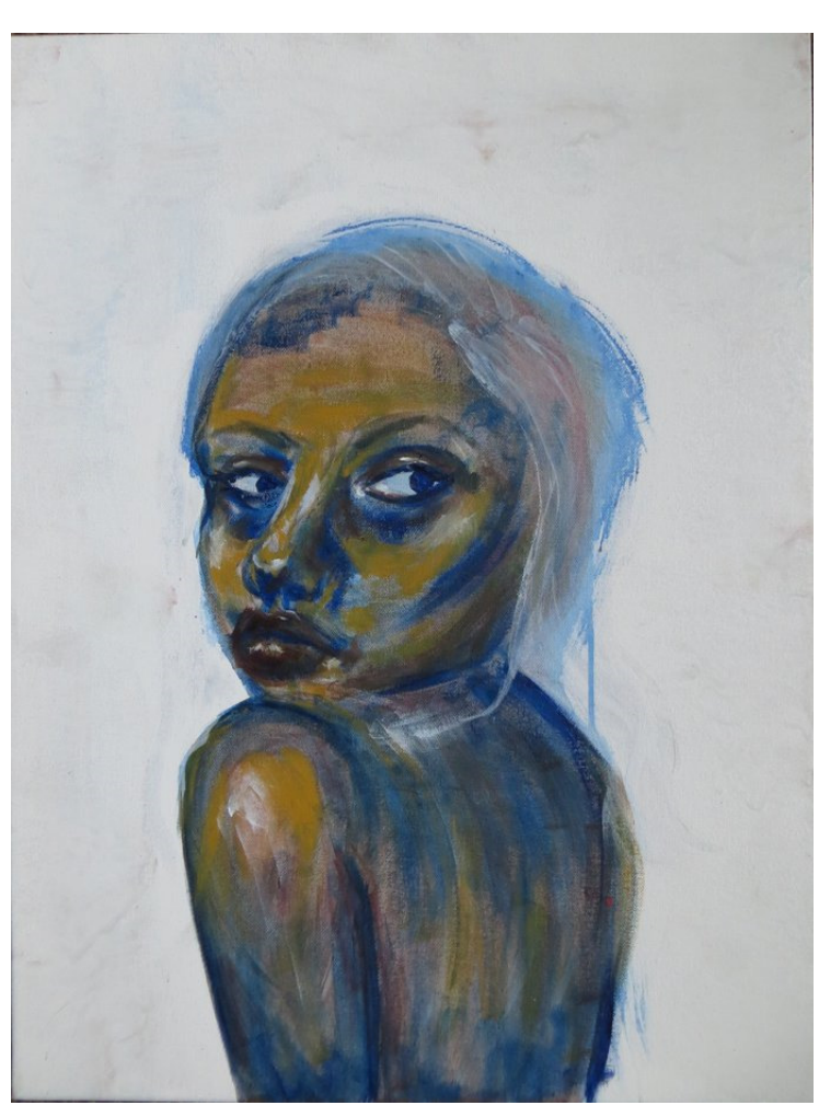
Entry #2 Blue Lady