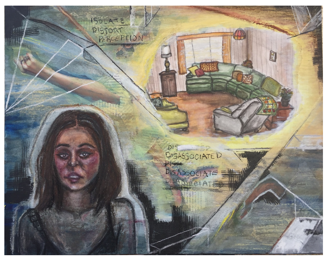
Entry # 6 Disassociated