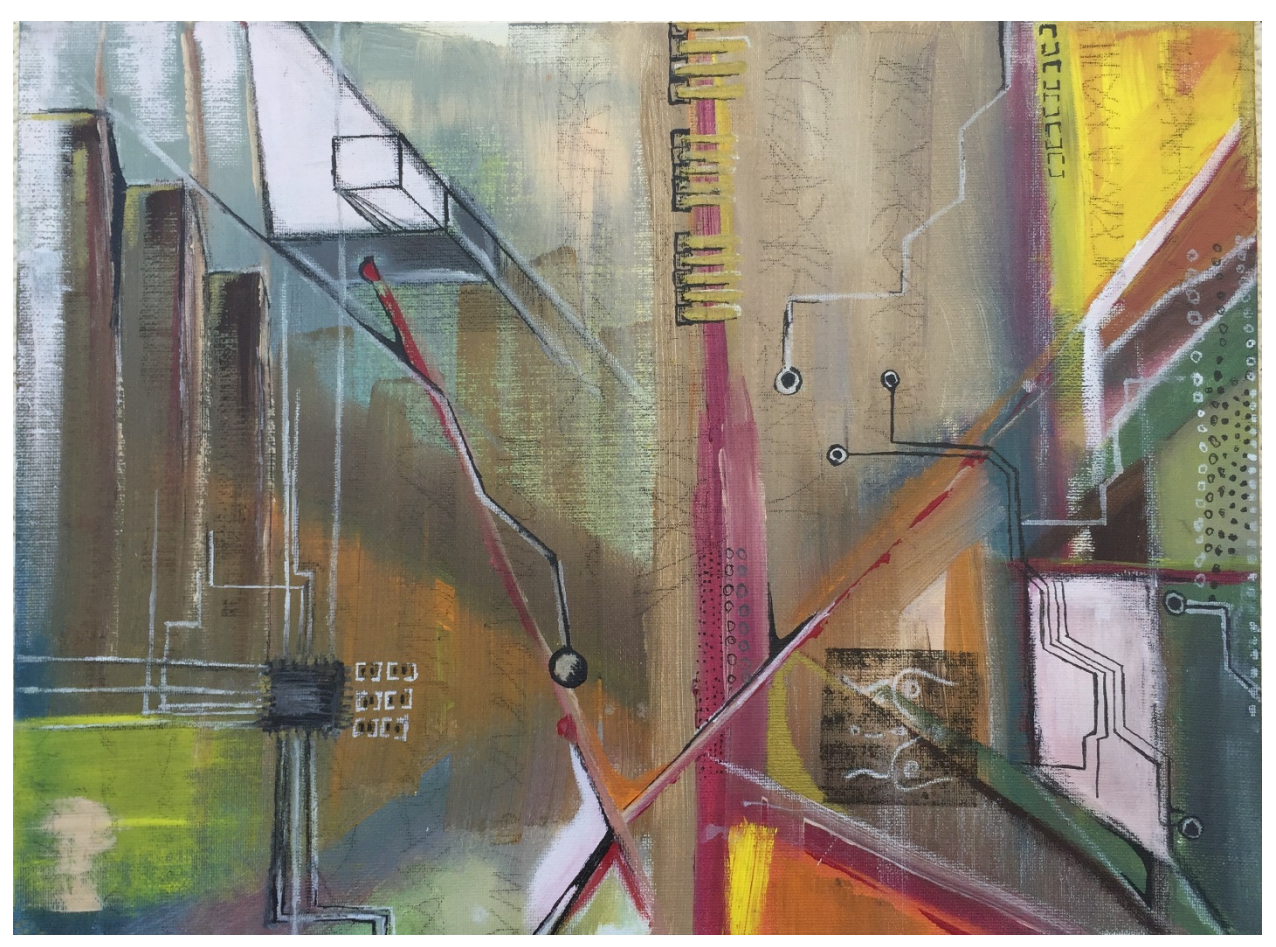
Entry#4 Computer Chip