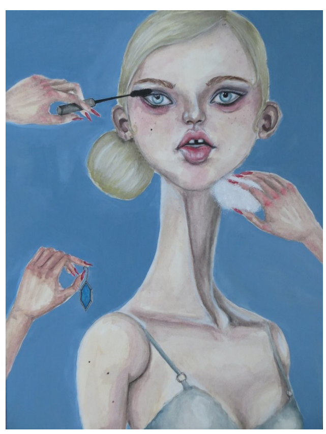
Entry #1 All Dolled Up