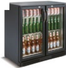
Undercounter bottle coolers