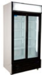
Upright drinks chillers