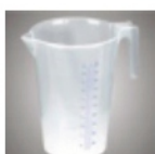
Measuring Jug (Plastic)