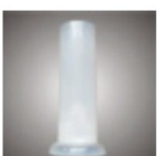
Forceps Jar (Plastic)