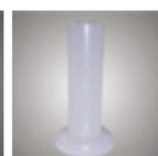
Thermometer Jar (Plastic)