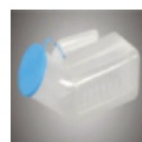
Urinal Pot (Plastic)