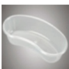
Kidney Tray (Plastic)