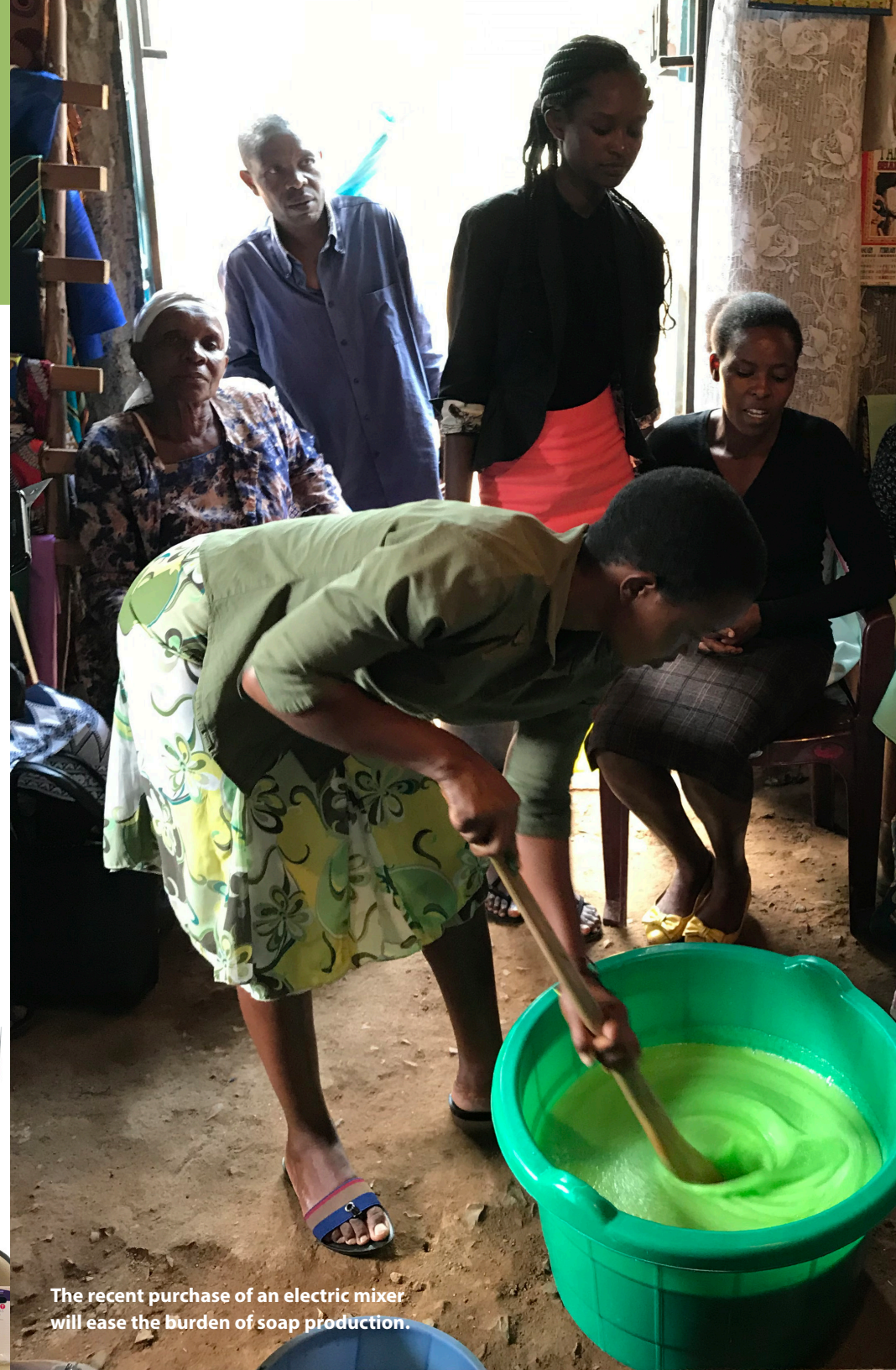
The recent purchase of an electric mixer will ease the burden of soap production.

D4G is excited to grow our US Impact through ministry partners who serve at-risk girls and women in our local community. More to come!!