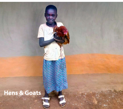
Hens & Goats