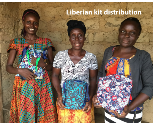
Liberian kit distribution