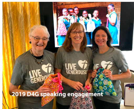
2019 D4G speaking engagement