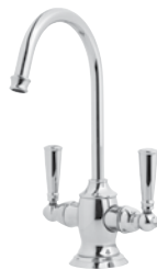
2470-5603 HOT AND COLD WATER DISPENSER