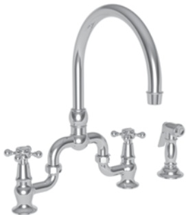
9460 KITCHEN BRIDGE FAUCET WITH SIDE SPRAY