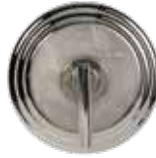
26 POLISHED CHROME