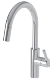
1500-5113 PULL-DOWN KITCHEN FAUCET SMALL SPRAY HEAD