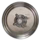
20 STAINLESS STEEL (PVD)