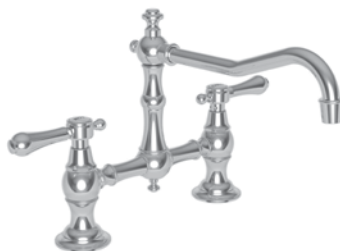
9461 KITCHEN BRIDGE FAUCET