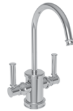
2940-5603 HOT AND COLD WATER DISPENSER