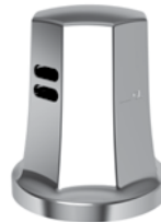
1200-5711 AIR GAP KIT

FOR ADDITIONAL PRODUCTS AND FINISHES AVAILABLE IN THE READYSHIP PROGRAM, SEE PAGE 17