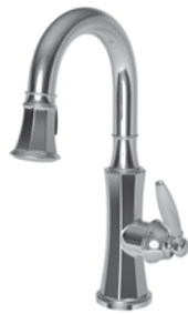
1200-5223 PREP/BAR FAUCET