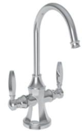
1200-5603 HOT AND COLD WATER DISPENSER