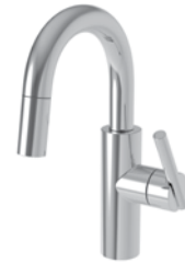
1500-5223 PREP/BAR FAUCET