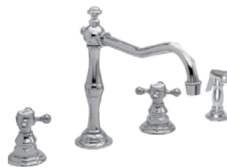
943 KITCHEN FAUCET WITH SIDE SPRAY