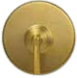
04 SATIN BRASS (PVD)

COLLECTION AVAILABLE IN THE FOLLOWING FINISHES: