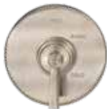
15S SATIN NICKEL