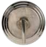
15 POLISHED NICKEL

COLLECTION AVAILABLE IN THE FOLLOWING FINISHES: