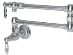
1200-5503 POT FILLER - WALL MOUNT