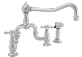
9452-1 KITCHEN BRIDGE FAUCET WITH SIDE SPRAY