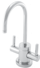
106 HOT AND COLD WATER DISPENSER