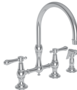
9458 KITCHEN BRIDGE FAUCET WITH SIDE SPRAY