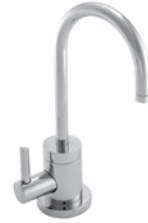
106H HOT WATER DISPENSER