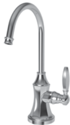
1200-5623 COLD WATER DISPENSER