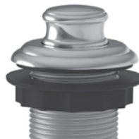
2470-5811 DISPOSER SWITCH

FOR ADDITIONAL PRODUCTS AND FINISHES AVAILABLE IN THE READYSHIP PROGRAM, SEE PAGE 17