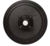
56 FLAT BLACK