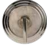
15 POLISHED NICKEL