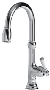
2470-5103 PULL-DOWN KITCHEN FAUCET