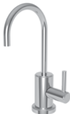
3180-5623 COLD WATER DISPENSER