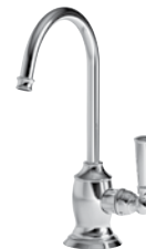
2470-5623 COLD WATER DISPENSER