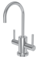
3180-5603 HOT AND COLD WATER DISPENSER