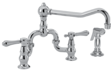
9453-1 KITCHEN BRIDGE FAUCET WITH SIDE SPRAY