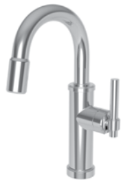
3180-5223 PREP/BAR PULL DOWN FAUCET