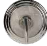
26 POLISHED CHROME