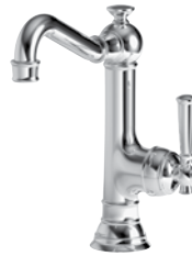
2470-5203 PREP/BAR FAUCET