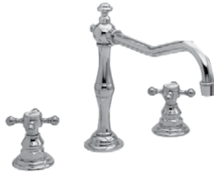
942 KITCHEN FAUCET