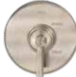
15S SATIN NICKEL