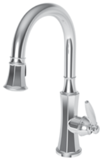
1200-5103 PULL-DOWN KITCHEN FAUCET