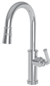
2940-5103 PULL-DOWN KITCHEN FAUCET