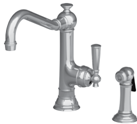
2470-5313 SINGLE HAND KITCHEN FAUCET WITH SIDE SPRAY