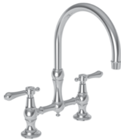
9457 KITCHEN BRIDGE FAUCET