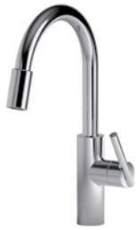
1500-5103 PULL-DOWN KITCHEN FAUCET