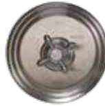
20 STAINLESS STEEL (PVD)