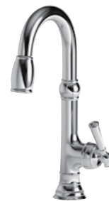
2470-5223 PREP/BAR PULL DOWN FAUCET