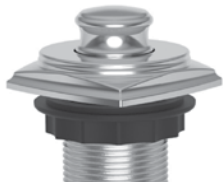
2940-5811 DISPOSER SWITCH

FOR ADDITIONAL PRODUCTS AND FINISHES AVAILABLE IN THE READYSHIP PROGRAM, SEE PAGE 17