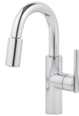
1500-5203 PREP/BAR FAUCET