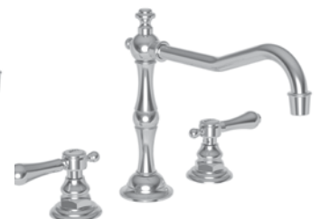
972 KITCHEN FAUCET

FOR ADDITIONAL PRODUCTS AND FINISHES AVAILABLE IN THE READYSHIP PROGRAM, SEE PAGE 17