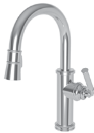
2940-5223 PREP/BAR PULL DOWN FAUCET