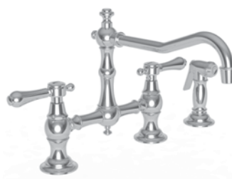
9462 KITCHEN BRIDGE FAUCET WITH SIDE SPRAY