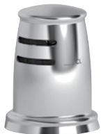
2470-5711 AIR GAP KIT