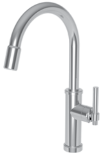
3180-5113 PULL-DOWN KITCHEN FAUCET