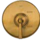
10 SATIN BRONZE (PVD)