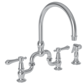
9459 KITCHEN BRIDGE FAUCET WITH SIDE SPRAY