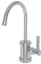
2940-5623 COLD WATER DISPENSER