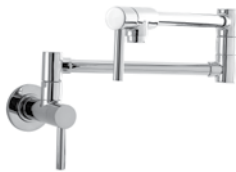
9485 POT FILLER WALL MOUNT