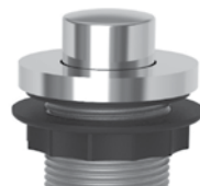
1500-5811 DISPOSER SWITCH

FOR ADDITIONAL PRODUCTS AND FINISHES AVAILABLE IN THE READYSHIP PROGRAM, SEE PAGE 17