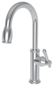
1030-5103 PULL-DOWN KITCHEN FAUCET