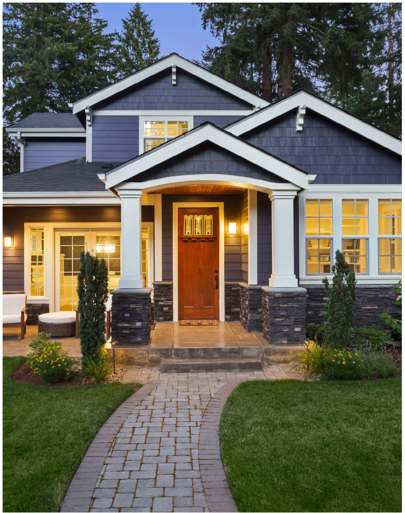
11/2018 © 2021 Old Republic Title [EZM0076 | The named agent above is a policy-issuing agent for Old Republic National Title Insurance Company. | Old Republic Title is providing this information as a free customer service and makes no warranties or representations as to its accuracy. Old Republic Title strongly recommends that consumers confer with their title insurer as underwriting requirements vary among companies and further, obtain guidance and advice from qualified professionals, including attorneys specializing in Real Property. Trusts and/or Title Insurance to get more detailed, and current, information as to any particular situation affecting them.