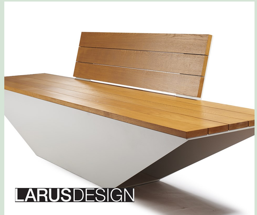
Above: The Oco Bench with backrest. This stylish public bench is made in Kambala wood on a stainless steel frame suitable for outdoors. Left: The Y-Bench. This modular bench adapts naturally into the landscape with practicality and sculptural modernity.