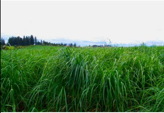
Crown Royale Orchardgrass production in Oregon