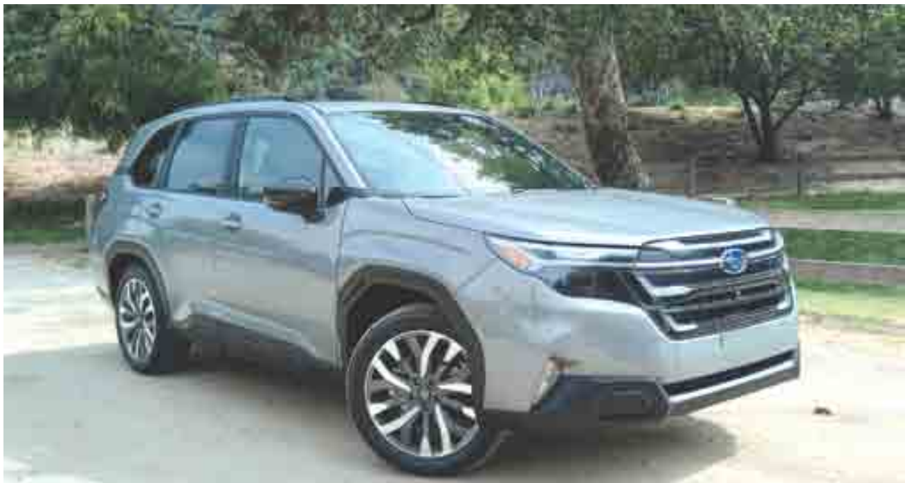
2025 Subaru Forester "First Drive"

You can get a base model (simply called "Forester") for just a tick over $31,000. My test vehicle was the top-level Forester Touring, which comes in at $41,390. There are a number of other trim levels in between.