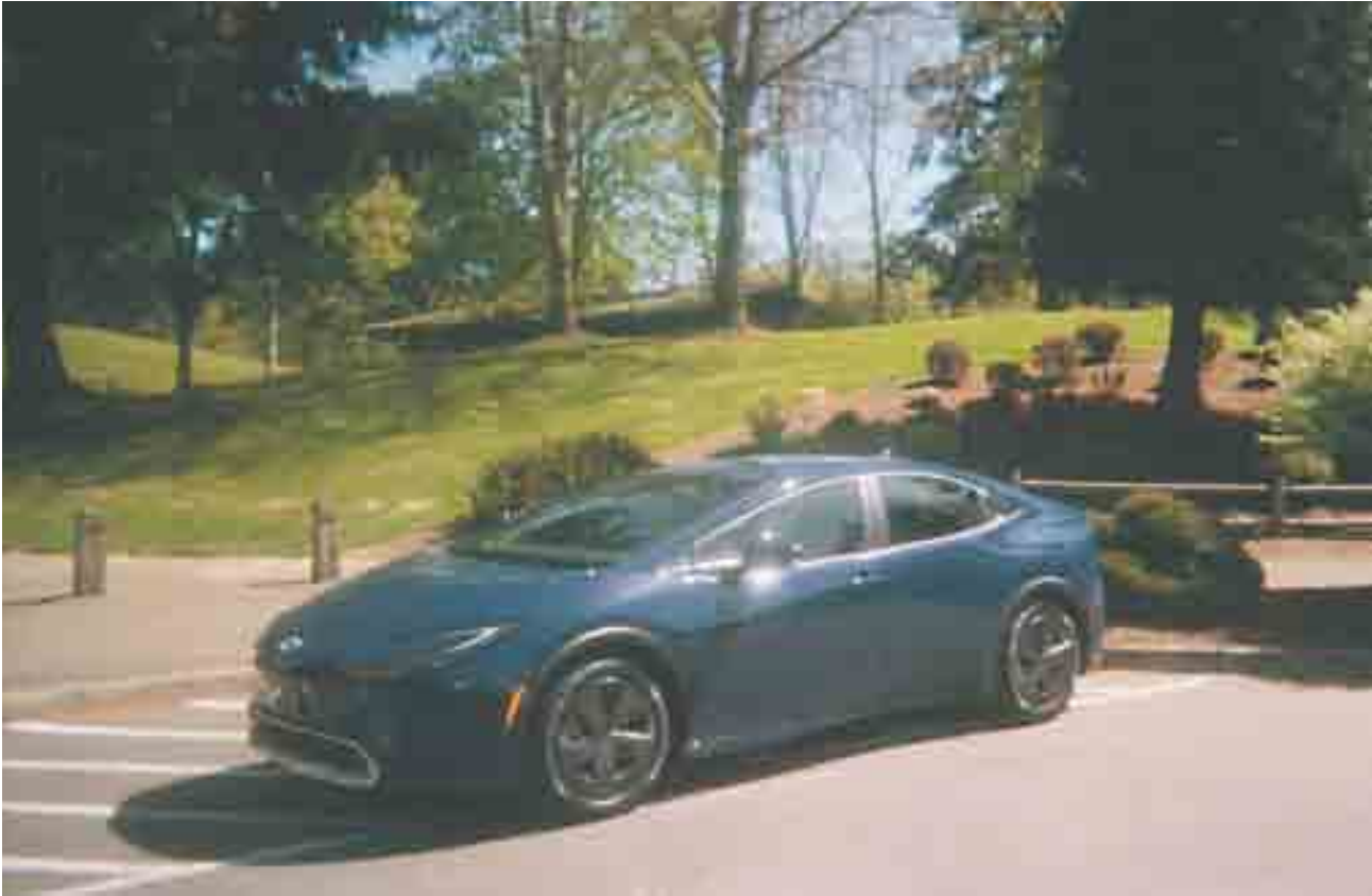
Toyota Prius Prime Plug-in Hybrid