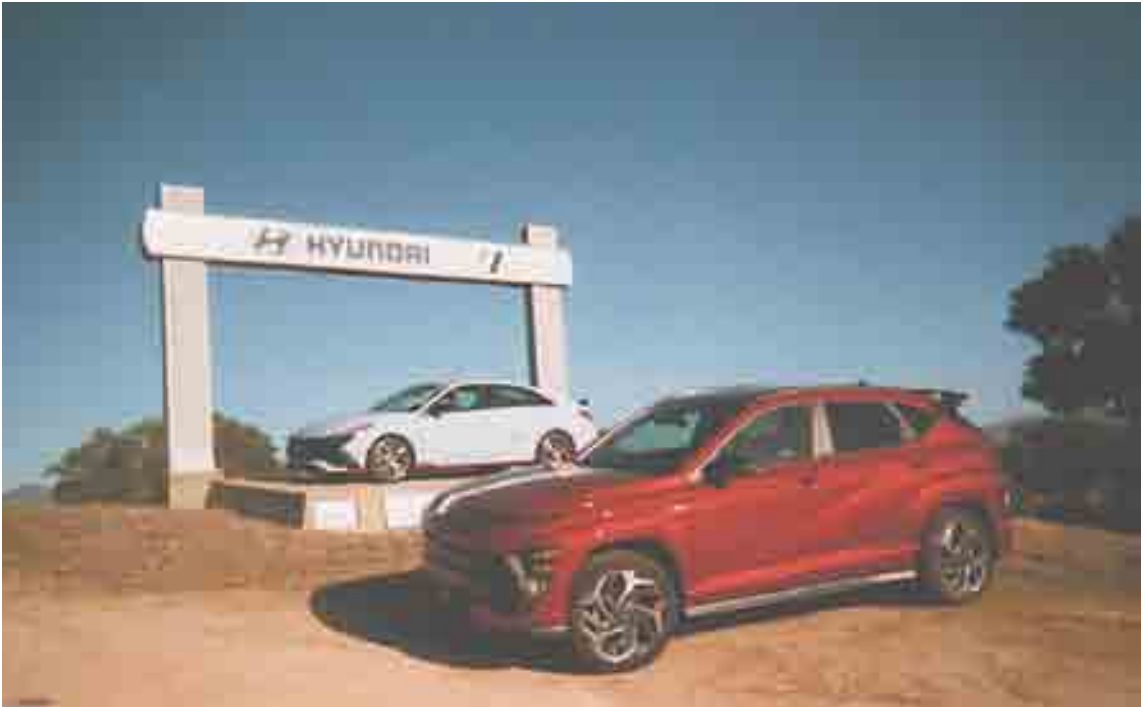
Hyundai Kona N-Line at the Entrance to Laguna SECA Race Track in Monterey, California during “Car Week” 2024