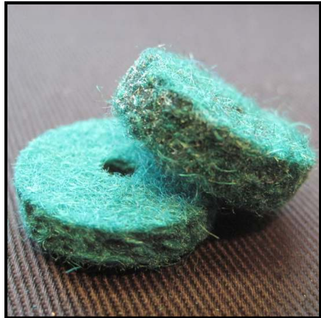
Thinnest and thickest front rail punchings.

Keybed felts come in a range of thicknesses, so that the original size of the felt installed at the factory may be duplicated. Paper and card punchings as thin as .002" are used under the felts for final adjustments necessary for level keys and even key dip.