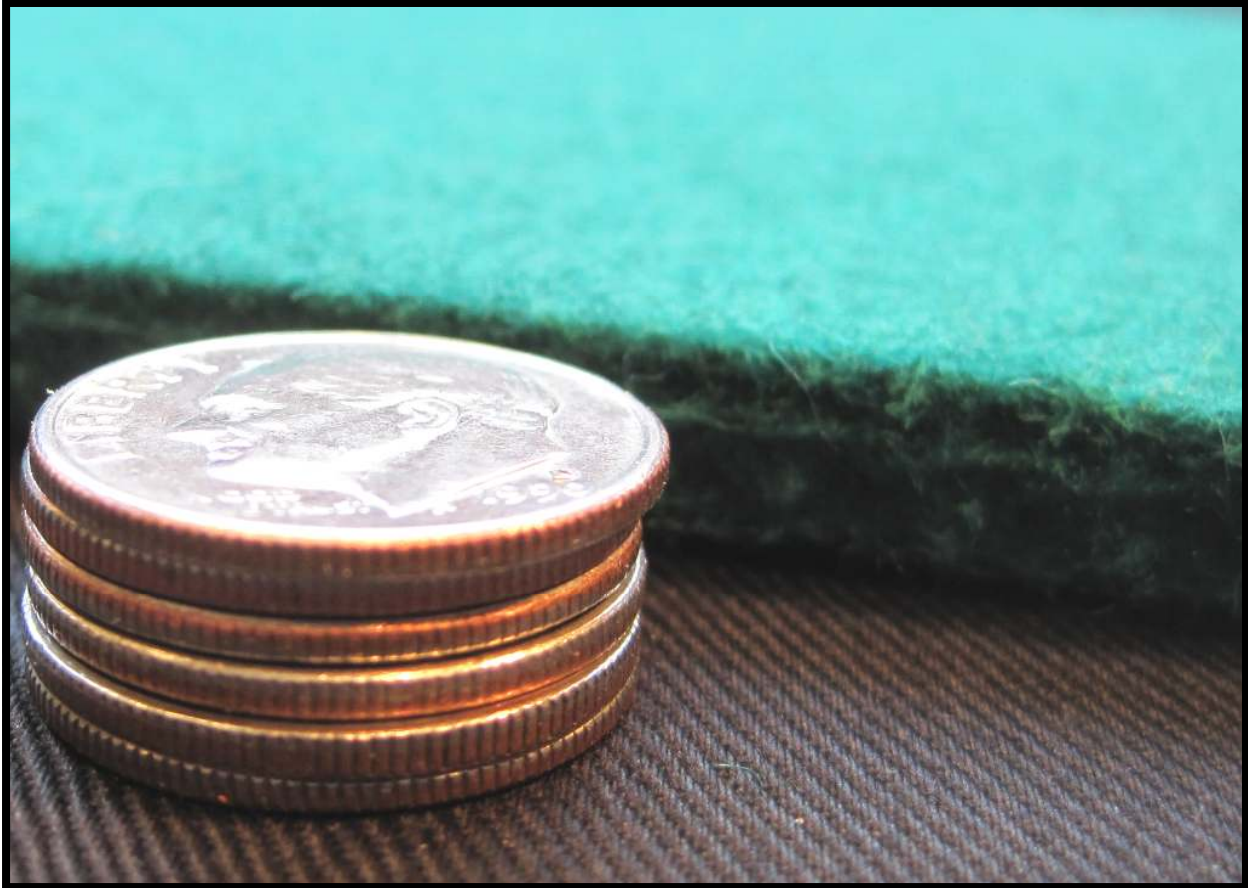
The thickness of heavy backrail cloth equals that of six dimes.