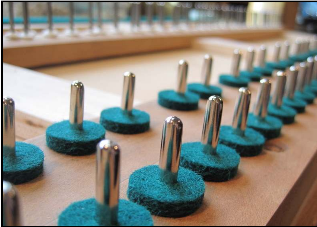
New set of keybed felts in place.

"In business to bring your piano to its full potential."