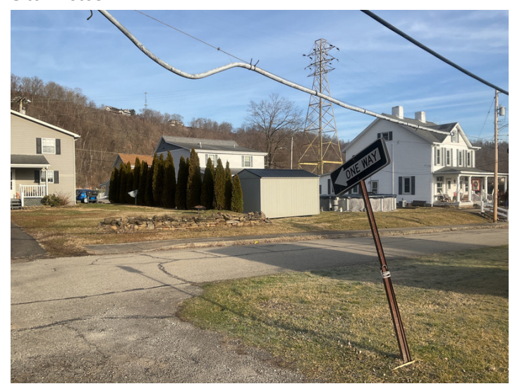
Site Locations - 2. California Township (Incl. Coal Center) - CT, 8