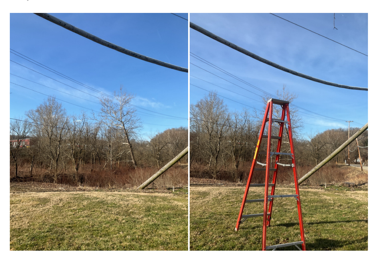
Site Locations - 3. California Township (Incl. Coal Center) - CT, 6