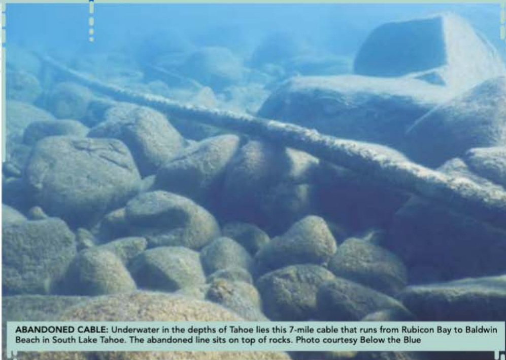
ABANDONED CABLE: Underwater in the depths of Tahoe lies this 7-mile cable that runs from Rubicon Bay to Baldwin Beach in South Lake Tahoe. The abandoned line sits on top of rocks.

"At the end of the day, there are hundreds of people swimming there and no one knows," Dreyer said of the cable. "Any potential that it could make someone sick is the worst violation."