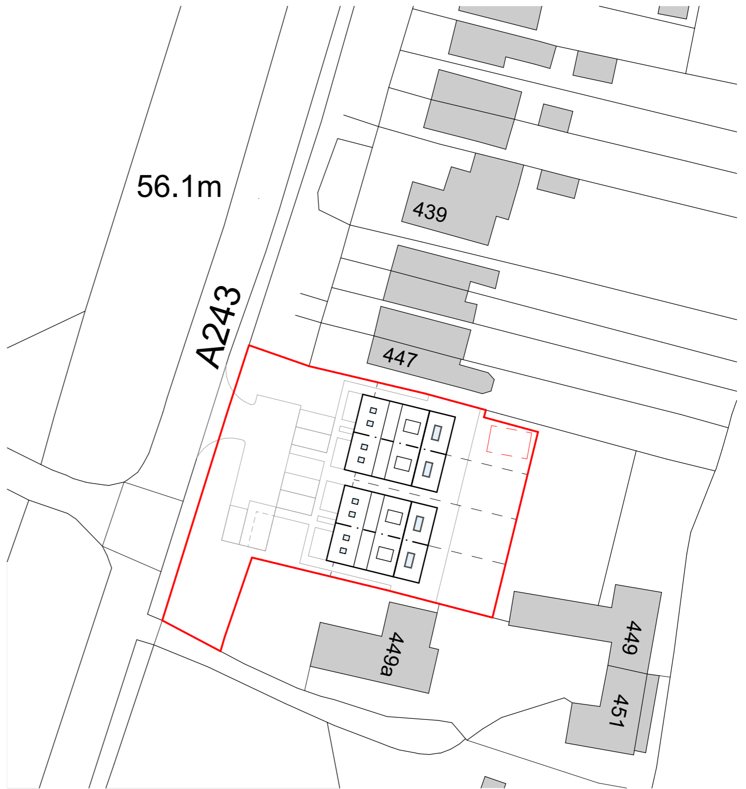
1 Proposed Block Plan 1:500