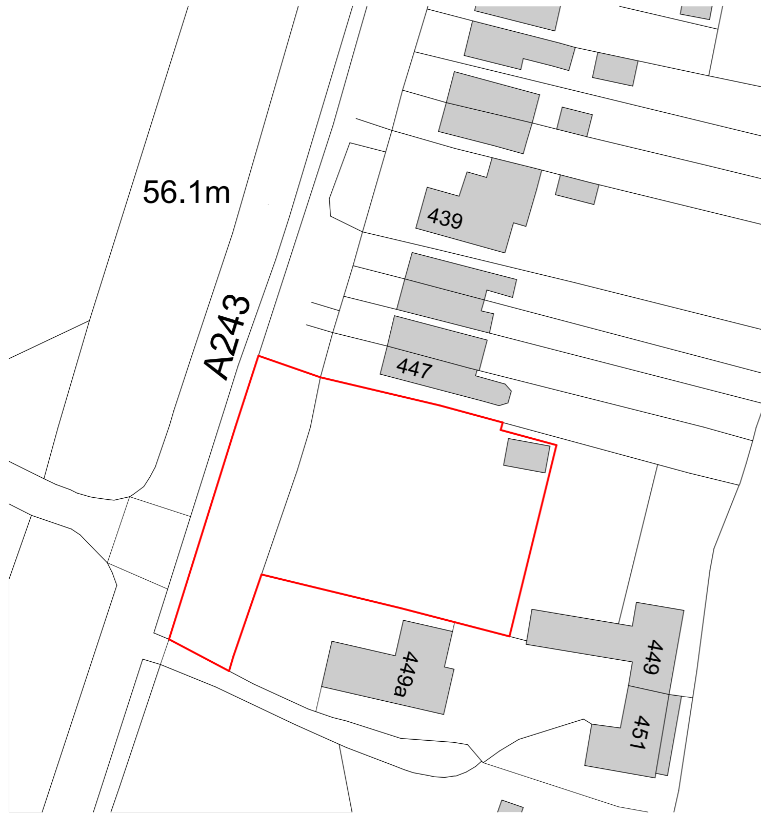
2 Existing Block Plan 1:500