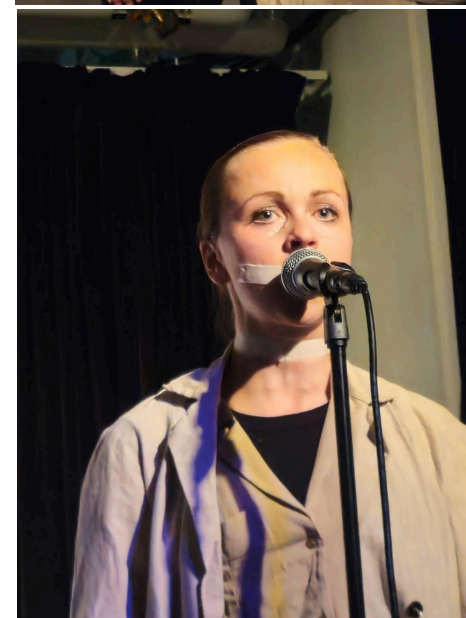
Refugee Safari @ Ava Nikpay Bataljonen, Goteborg 2025.