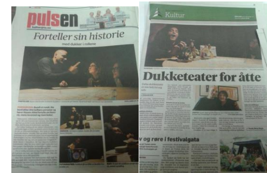
Porsgrunn International Theatre Festival, Norway