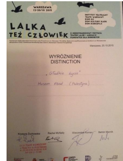
A puppet is a human too festival, 10 th International festival of puppet theatre and animated films for adults Warsaw, Poland

http://lennonwall.auni.edu/index.php/2015/11/20/the-story-of-palestinian-refugee-rice-grains/