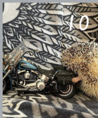
Crunchies' winning photo