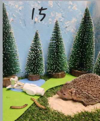
Ysvarkies' winning photo