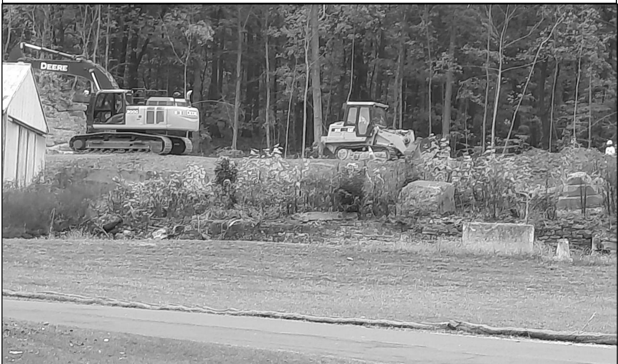
Phase 1 of the project placed clean fill below the walls, which was then planted with grass seed (seen at the bottom of the photo). Phase 2 of the project did the same above the walls and is wrapping up over the winter. The low wall that was buried is now the grassy hill in the middle of this photo.