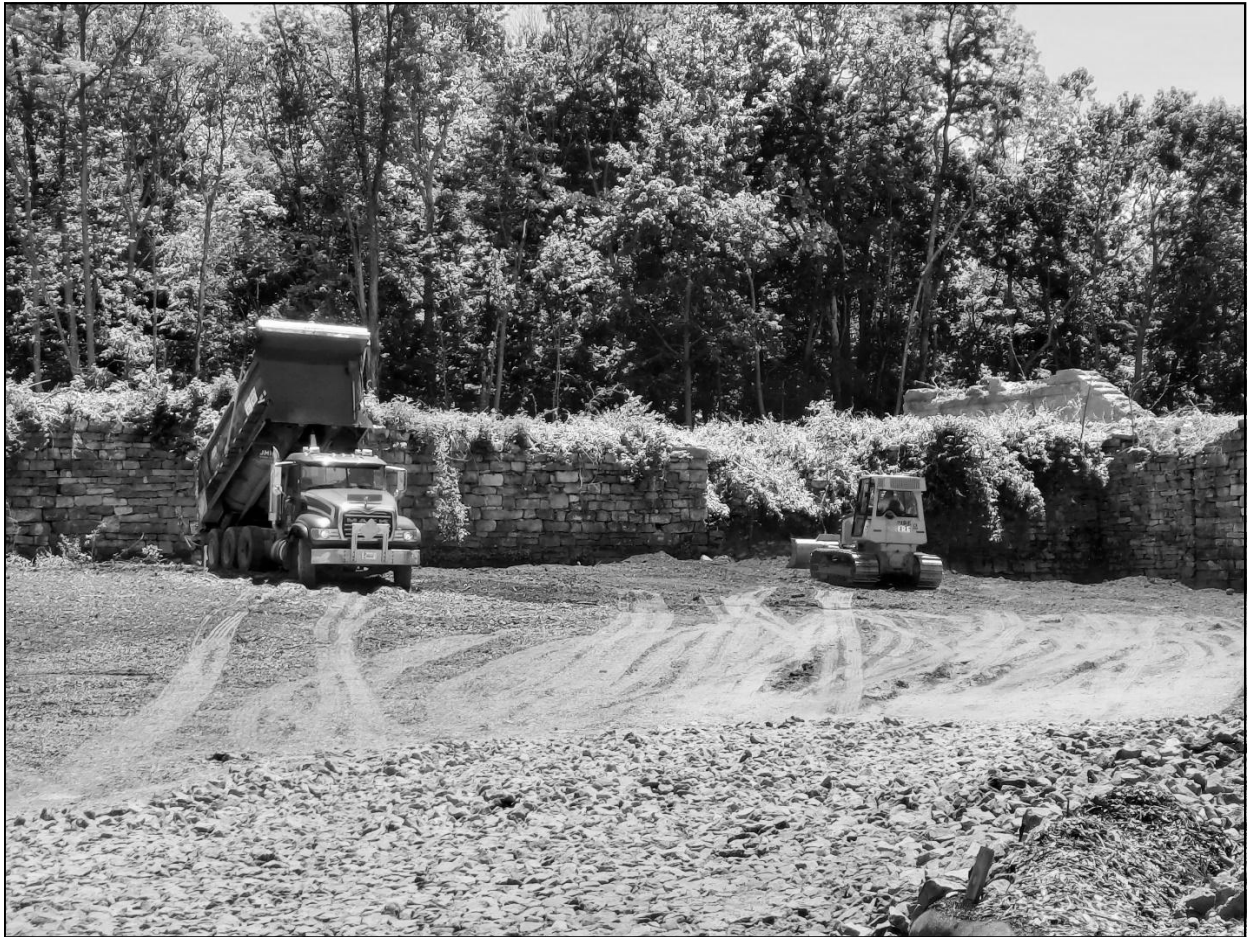
Contractors graded the uneven site and covered the contaminated soil with two feet of clean soil hauled in from off-site over the summer. The amazing stone masonry walls of the Robesonia Furnace are now fully visible and owned by the Borough of Robesonia.