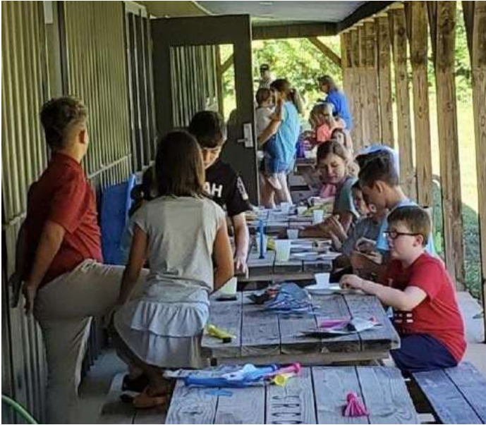
Vacation Bible School July 2024