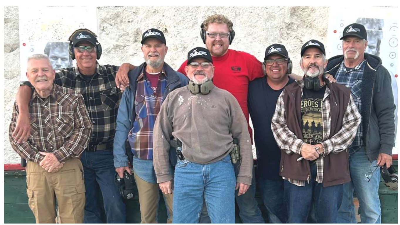
STRATEGOS –Peacekeeper's Church Security Team Training Tactical Firearms Training