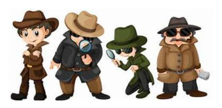
ON THE CASE

June 19^{th}-22^{nd} * 5:30 - 7:30 pm Ages 2 to 12