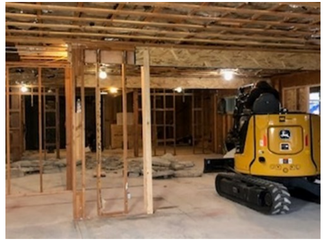
And the walls came tumbling down!