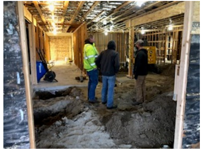
Out came the cement floors.