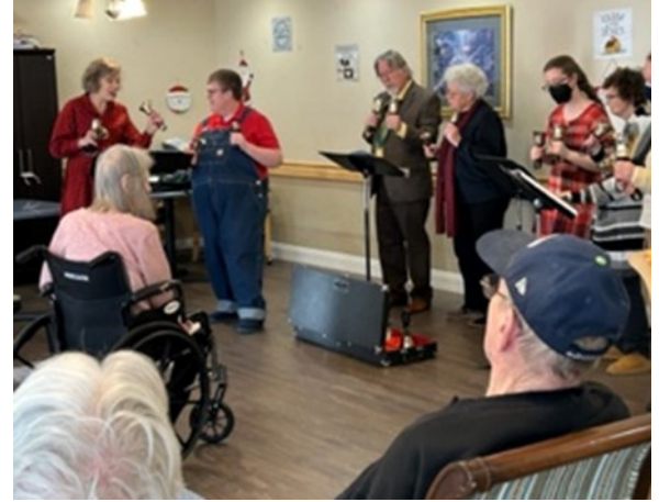
Bells of Grace accompany a Christmas carol sing-along at Blossom Creek.