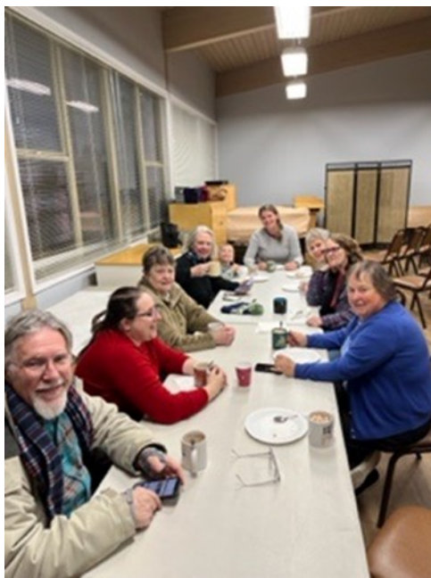
The Christmas tree-hunting crew