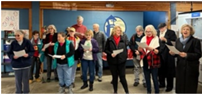
Voices of Grace sing carols at Lighthouse Christian Ministries.

Each year we send Valentines to college students, military personnel and other far-flung friends of Grace. The valentines will be in the Fellowship Hall on Sunday, February 9, for you to sign. Please take a minute to add a greeting or simply sign your name. We'll add some treats and send the love to our siblings in Christ who are away from home.