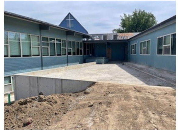
A retaining wall goes up for the back patio space.