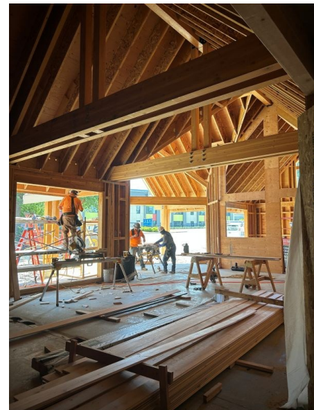
The new narthex area is taking shape.