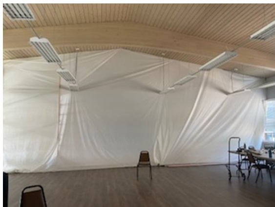
Asbestos abatement took place behind this plastic sheeting in the Fellowship Hall.