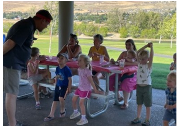
Walla Walla Point Park