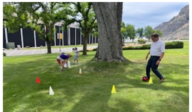
Rocky Reach Park