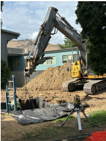
Work on the dry well to improve drainage.