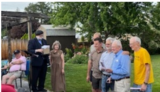
The bass section of Voices of Grace received its award at an end-of-season celebration.

Proverbs 25:6-7a Psalm 112 Hebrews 13:1-8, 15-16 Luke 14:1, 7-14