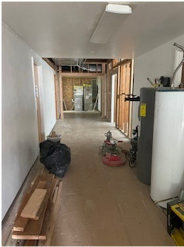
Work continues below the Fellowship Hall.

We are still moving forward and are grateful for the opportunity to see these improvements to completion.