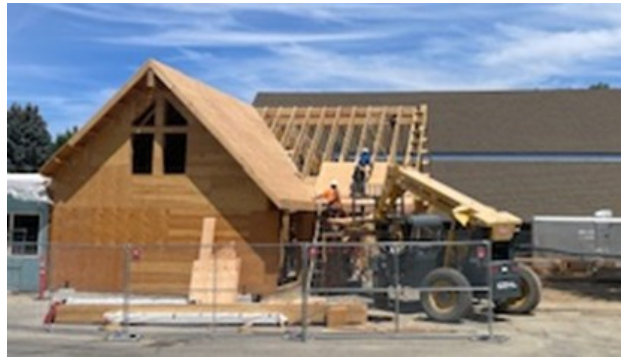
The roof takes shape.