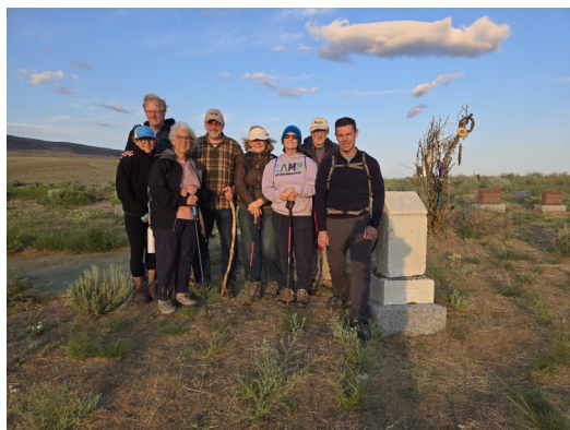
Hike and Seek June 20, 2025