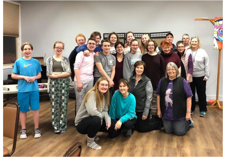
In February, more than 20 Grace Lutheran youth and adults participated in the 30 Hour Famine.

World Vision is a Christian humanitarian organization dedicated to working with children, families, and their communities worldwide to reach their full potential by tackling the causes of poverty and injustice. Motivated by our faith in Jesus Christ, we serve alongside the poor and oppressed as a demonstration of God's unconditional love for all people. We serve all people, regardless of religion, race, ethnicity, or gender. Visit worldvision.org to learn more.