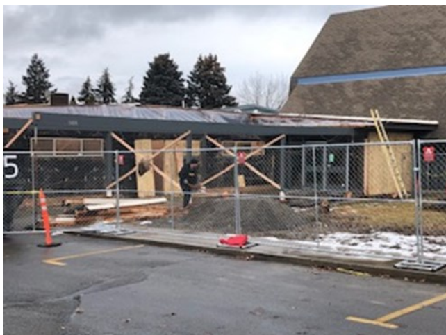
The timber came down....