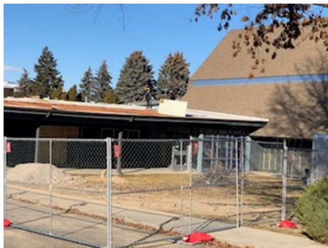
The next day, fencing was erected and a portion of the roof was removed.