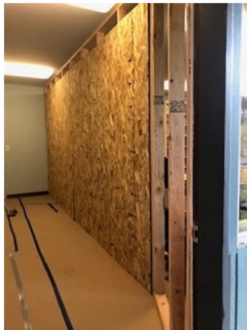
... and some went up (a temporary wall in the Multi-purpose Room prepares workers for a fire wall installation).