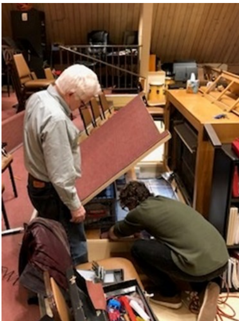
Two technicians from Bond Organ Builders, Inc. work to repair a broken solder in the pedal division.