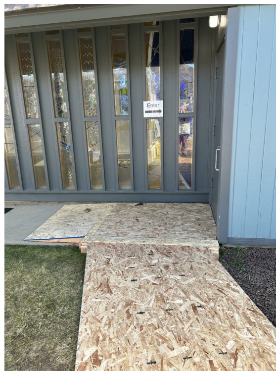
...and for the accessible entrance through the sacristy door.