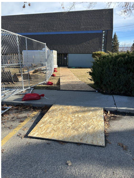
We thank Rimmer and Roeter for quick construction of a ramp and walkway from the parking lot...