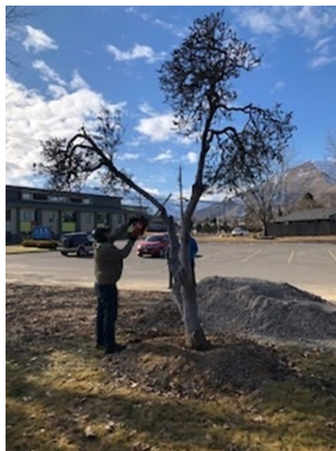
...cut it down.