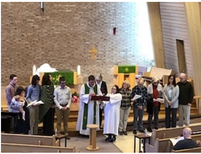
Eleven new members are received on January 26.