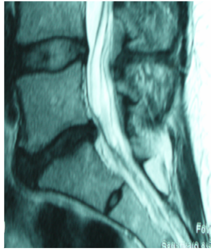
Figure 1. An abnormal disc at L5/S1 on MRI scan

The pain is usually very mechanical in nature, being made worse with activity and relieved by rest. Sometimes the pain may feel very deep inside and rarely there is a radiation of the pain into the front. eg. at L5/S1 patients can have groin pain or testicular pain (in males). Throughout the day the disc loses height and becomes increasingly compressed (which is why we are shorter in the evenings than the mornings) and it is this progressive compression that often makes the pain worse with activity throughout the day although morning stiffness can also be a feature.