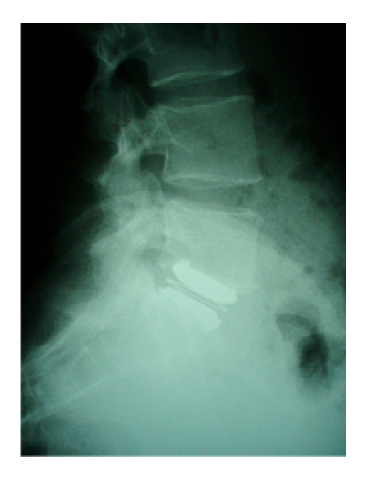
Figure 3. Total disc replacement (Charite) in the same patient

If surgery is confined to selective patients and strict entry criteria are met – as above – then 90% good excellent results can be achieved. It should be emphasised however, that if these options are used in all patients without selectivity then results will not be as good, and hence the reason for a good assessment.