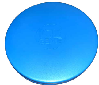
Tight Seal Lid