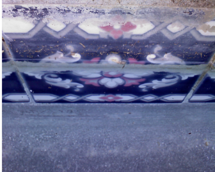
Before Beautec, scale deposit up to 1/4" thick