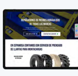
Forklift Service Landing page