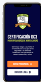
DC3 Certification Landing page

Check some of the projects I have designed from scratch: